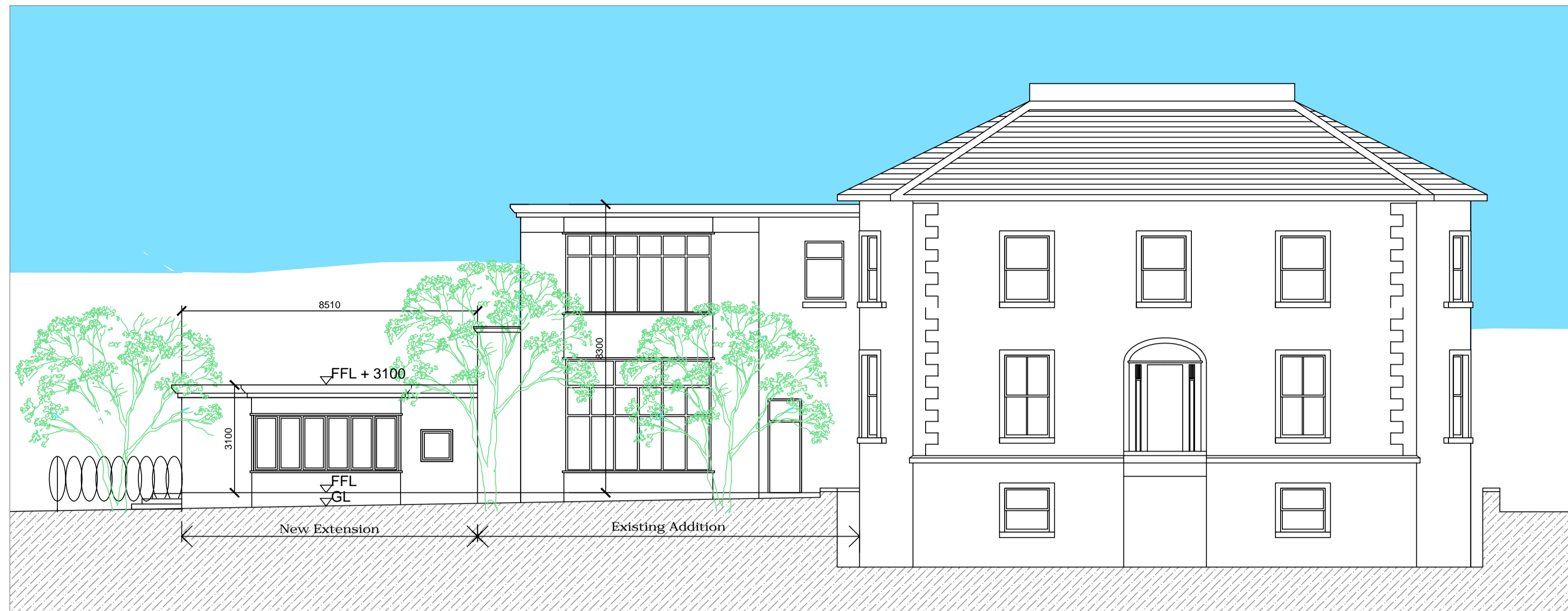
FRONT (SOUTH) ELEVATION 1:100