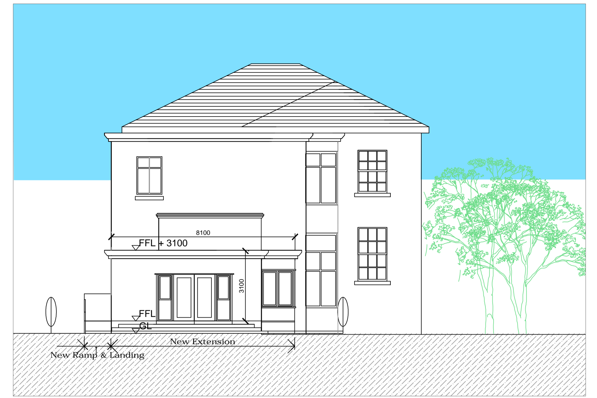
END (WEST) ELEVATION 1:100