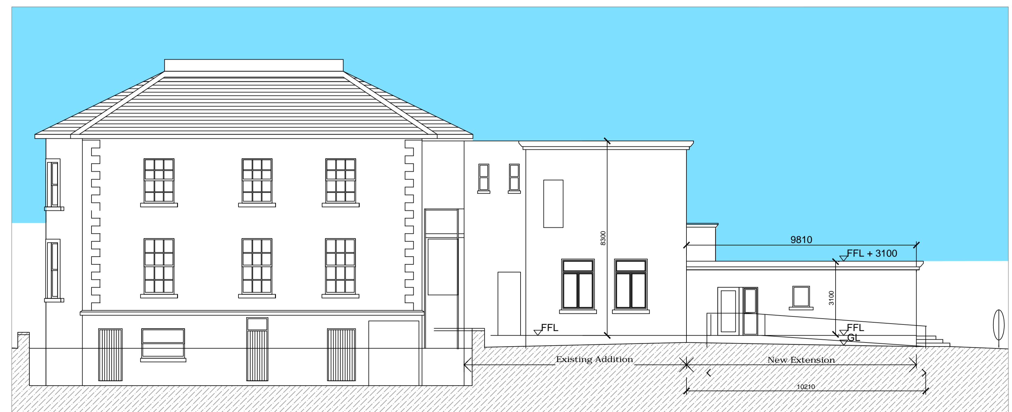
REAR (NORTH) ELEVATION 1:100