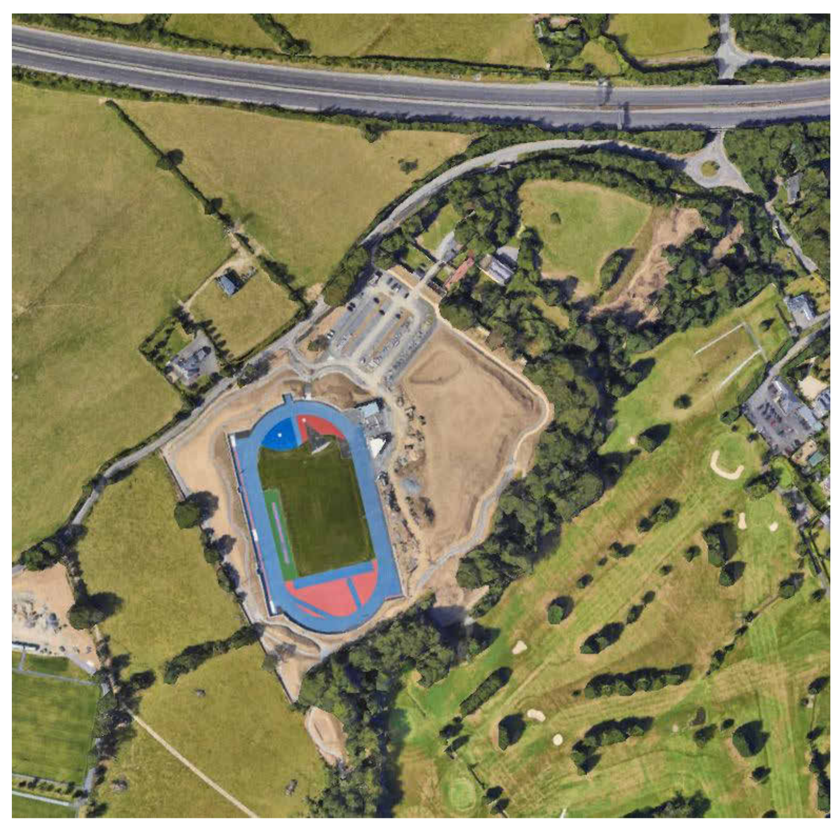
SITE AERIAL IMAGE