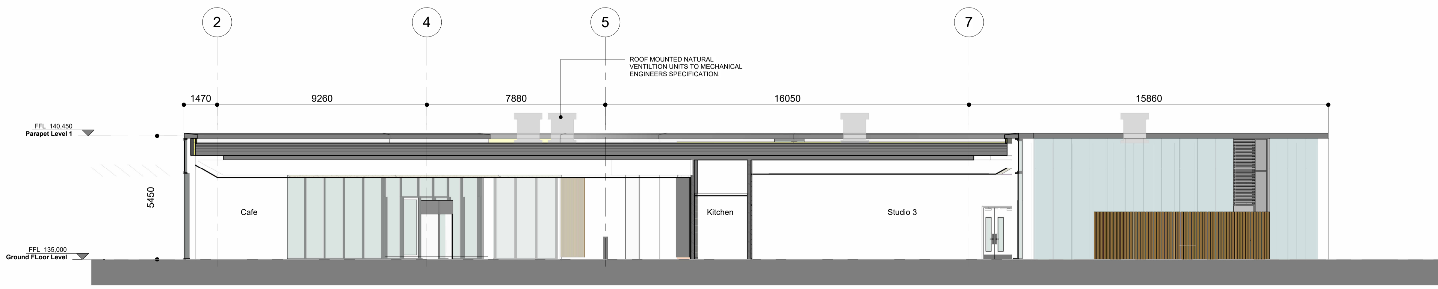
2 Section D-D 1 : 100