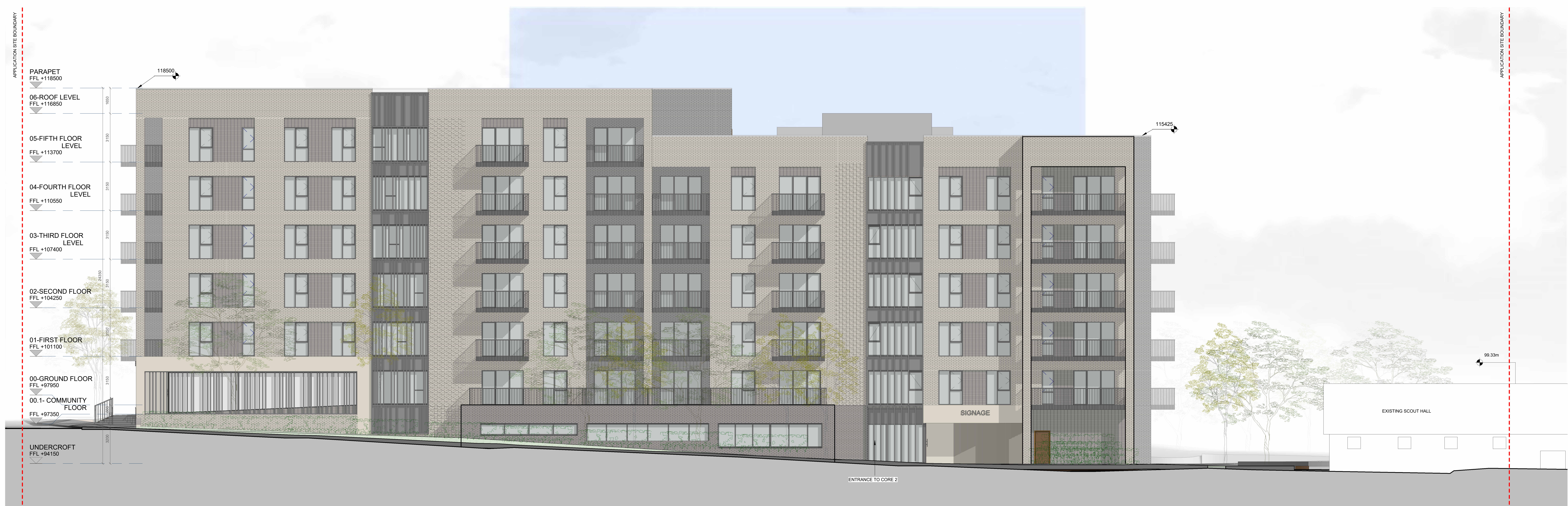
EAST ELEVATION SCALE: 1 : 100

NOTES: DO NOT SCALE FROM DRAWINGS. WORK TO FIGURED DIMENSIONS ONLY. ARCHITECT TO BE NOTIFIED OF ALL DISCREPANCIES.