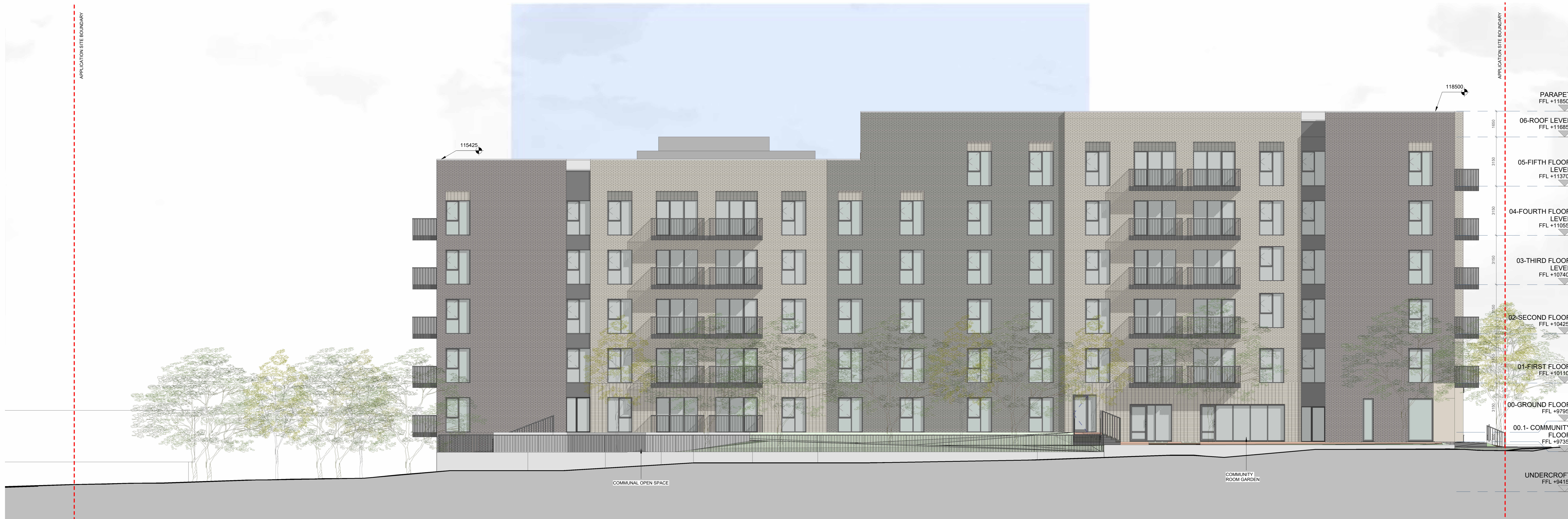
WEST ELEVATION SCALE: 1 : 100

NOTES: DO NOT SCALE FROM DRAWINGS. WORK TO FIGURED DIMENSIONS ONLY. ARCHITECT TO BE NOTIFIED OF ALL DISCREPANCIES.