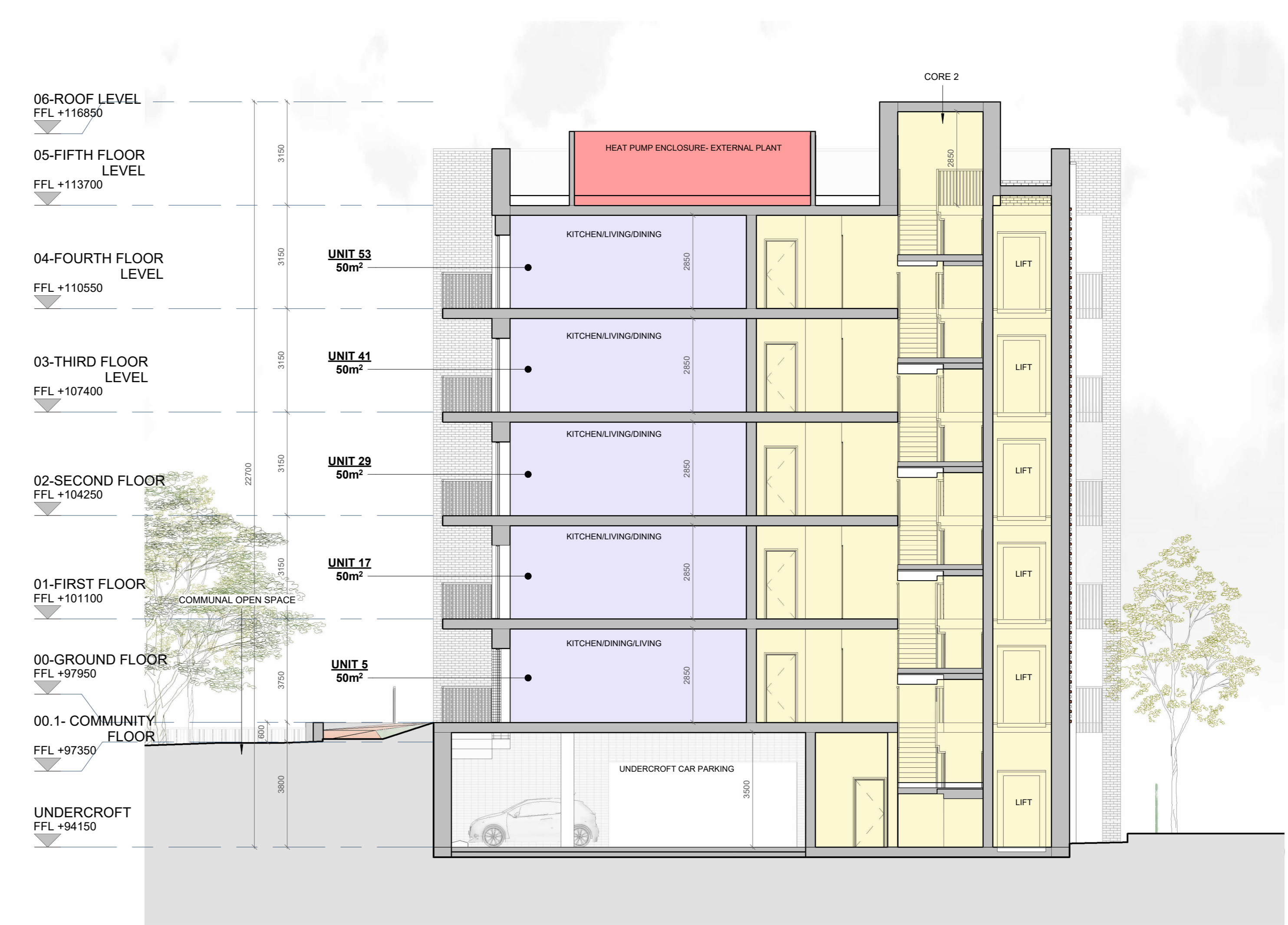
Section B-B SCALE: 1 : 100