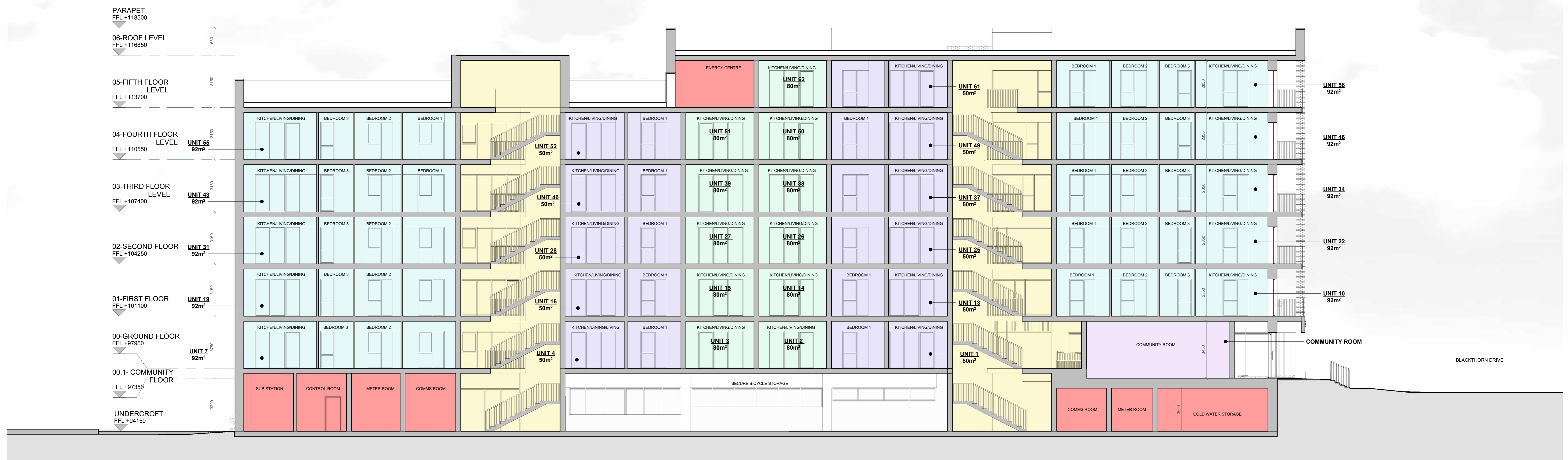
Section C-C SCALE: 1 : 100

NOTES: DO NOT SCALE FROM DRAWINGS. WORK TO FIGURED DIMENSIONS ONLY. ARCHITECT TO BE NOTIFIED OF ALL DISCREPANCIES.