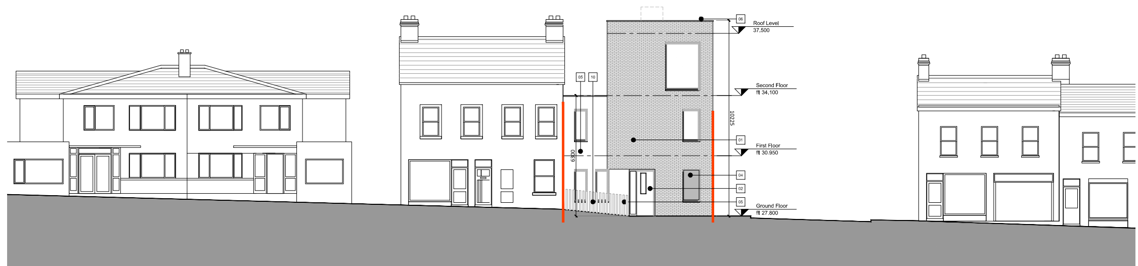
02 Elevation onto Patricks Street Scale 1:200