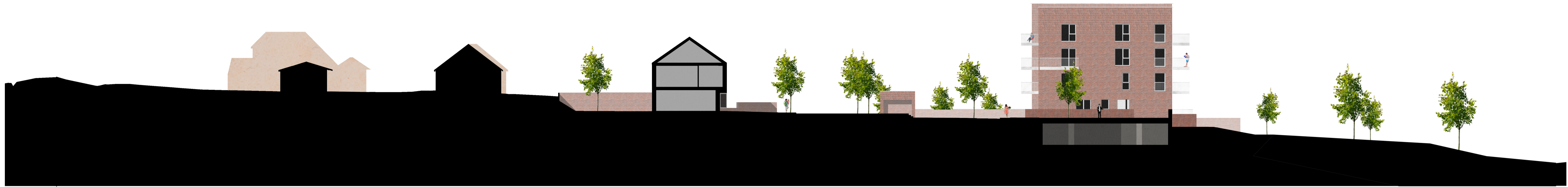
01 Site Section AA 1 : 250