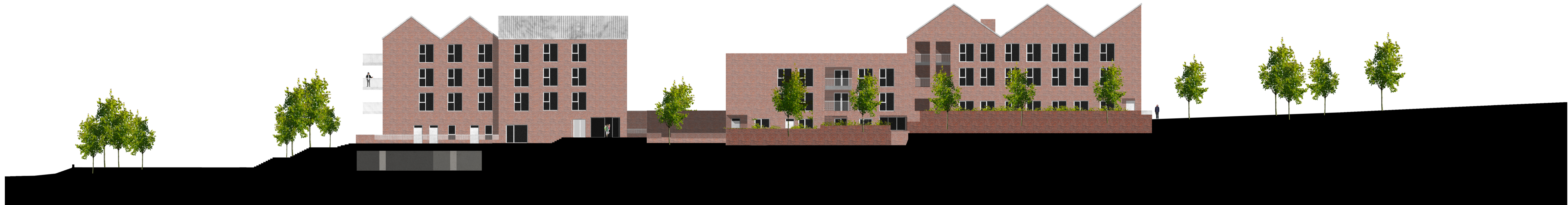
03 Site Section CC 1 : 250