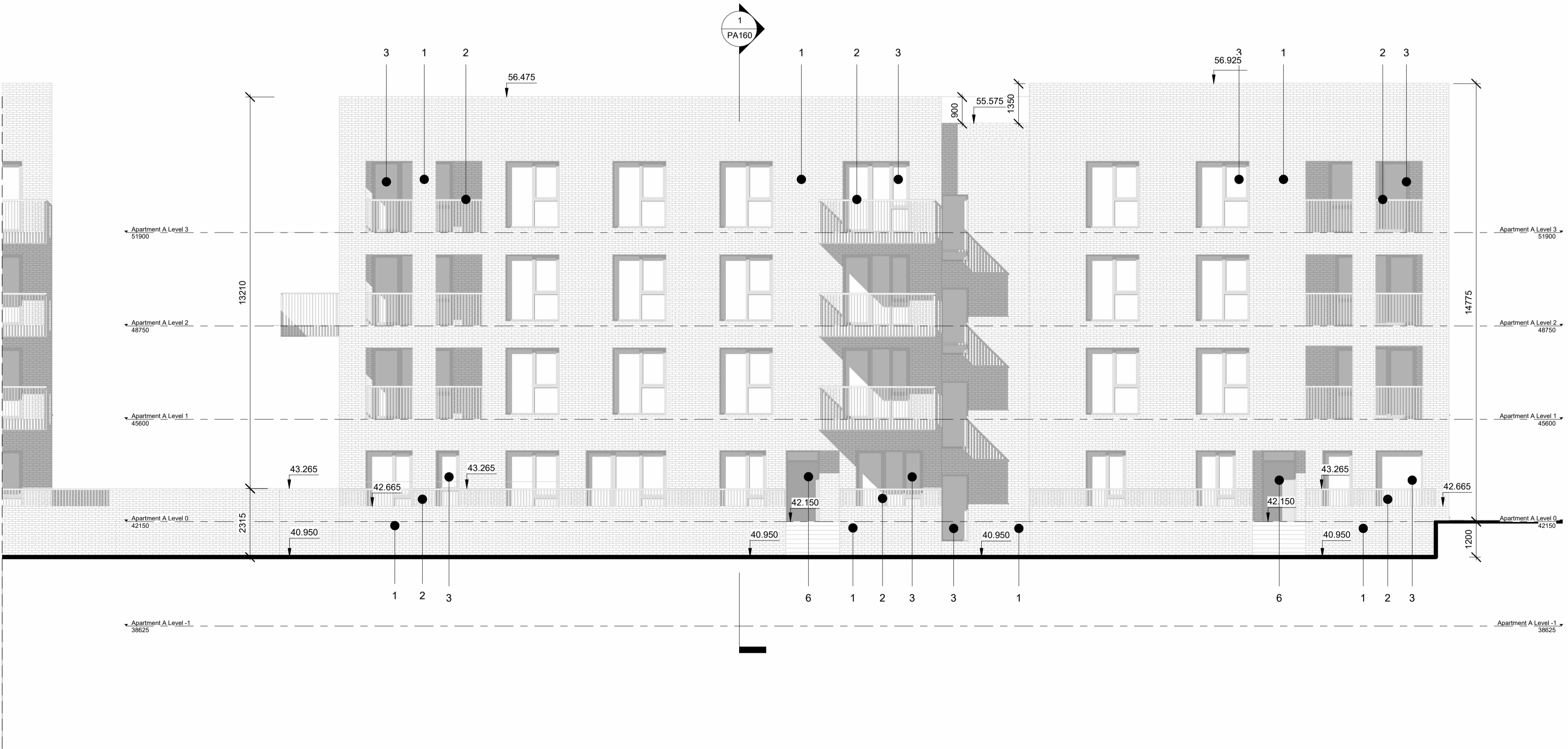
03 Block A1 - East Elevation 1 : 100