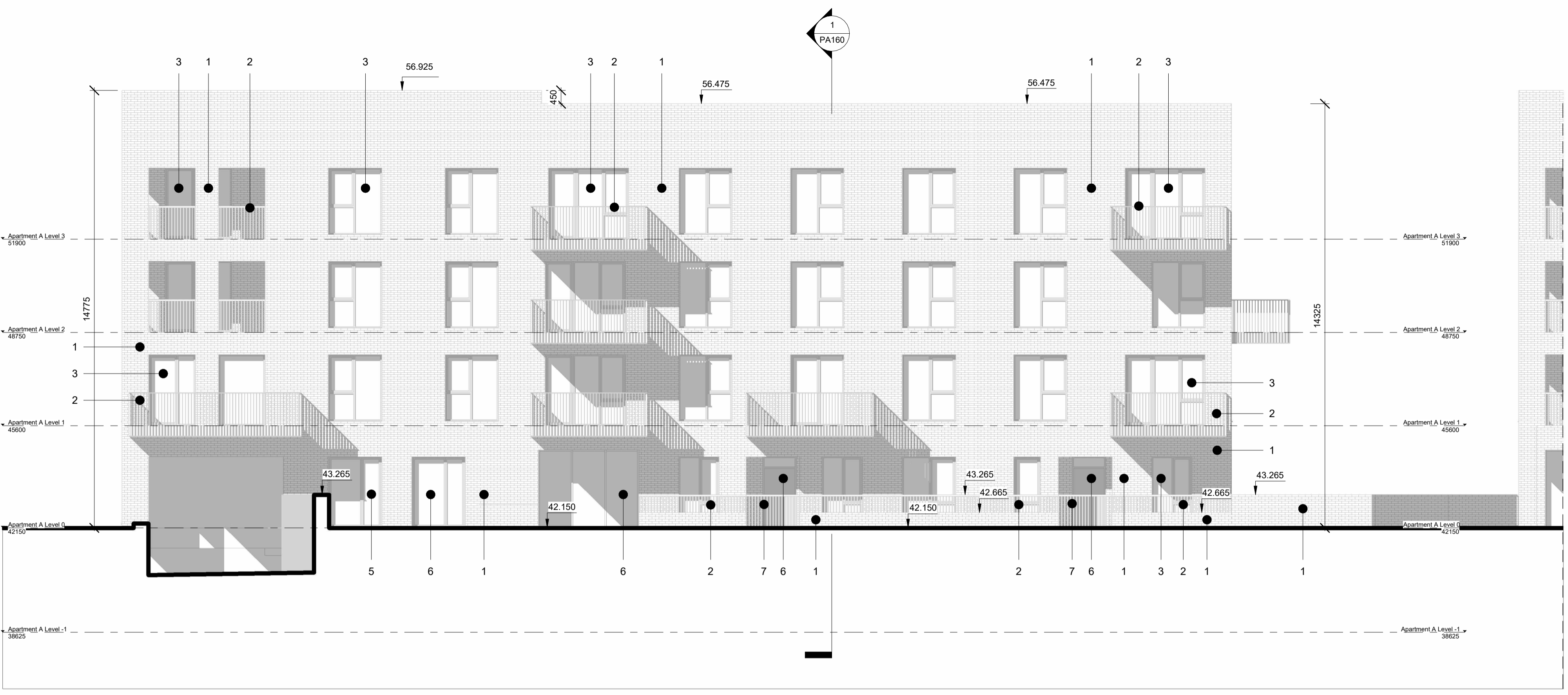
01 Block A1 - West Elevation 1 : 100