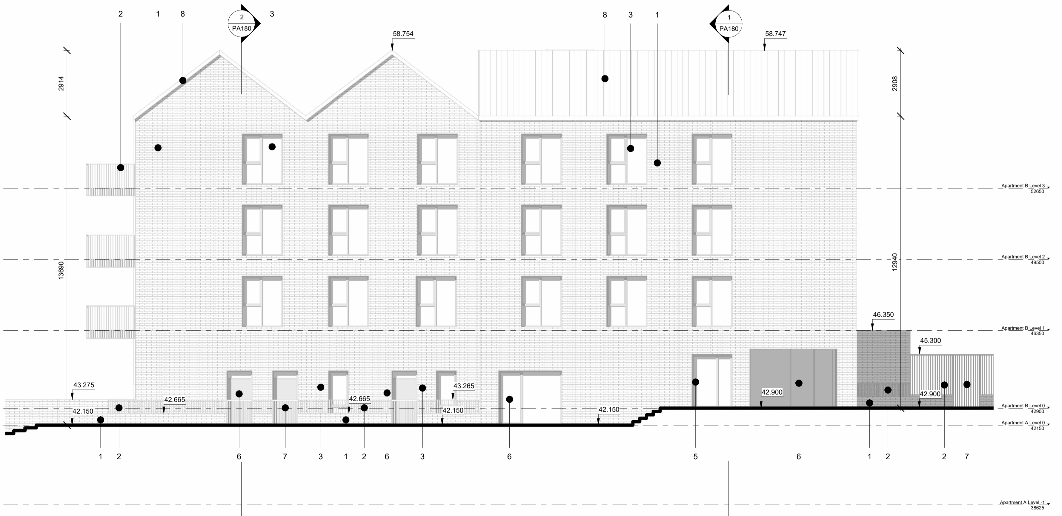
04 Block B - North Elevation 1 : 100