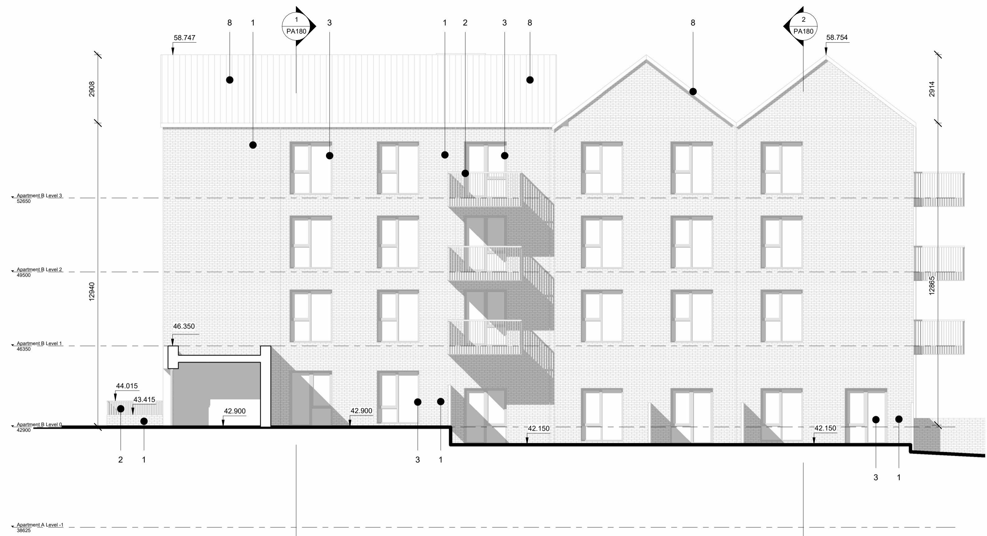
02 Block B - South Elevation 1 : 100