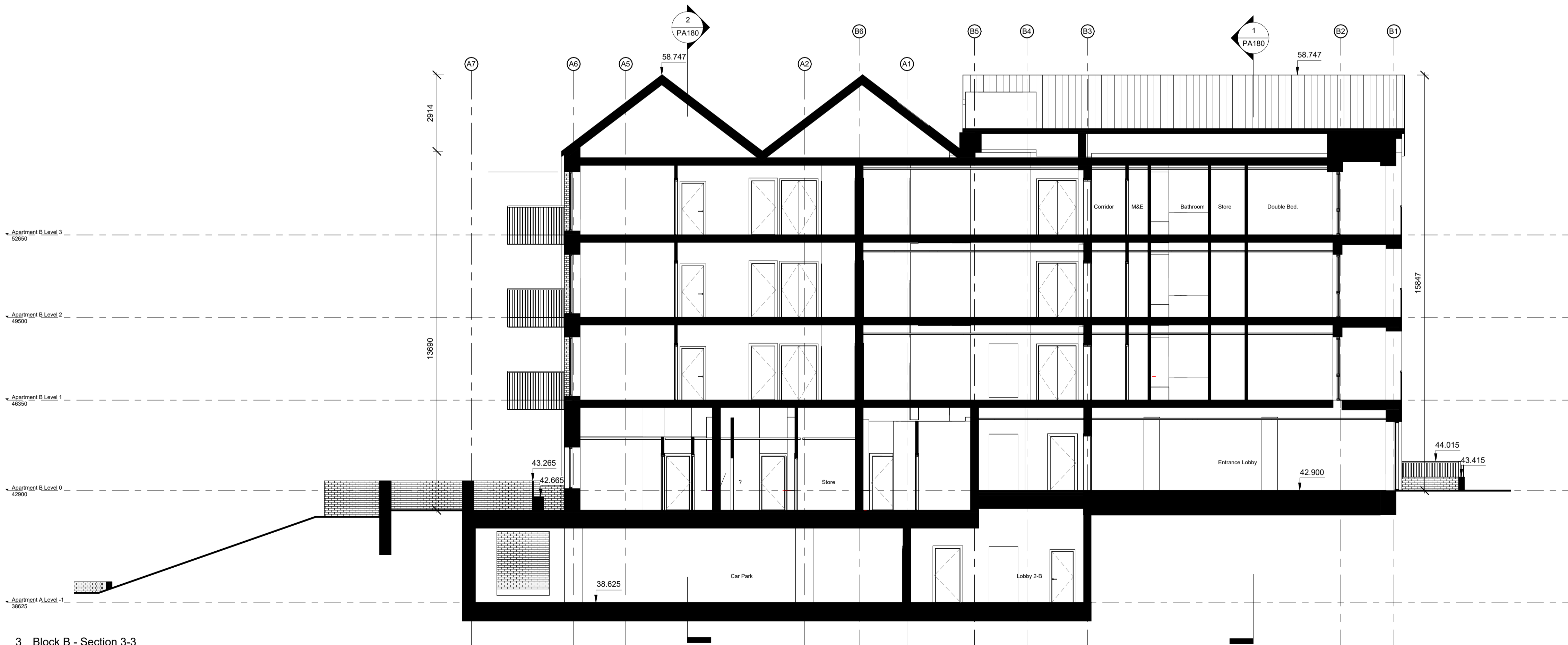
3 Block B - Section 3-3 1 : 100

STATUS OF DRAWING PLANNING ALL DIMENSIONS TO BE TAKEN FROM ARCHITECTS DRAWINGS DISCREPANCIES TO BE REFERRED TO THE ARCHITECT FOR CLARIFICATION