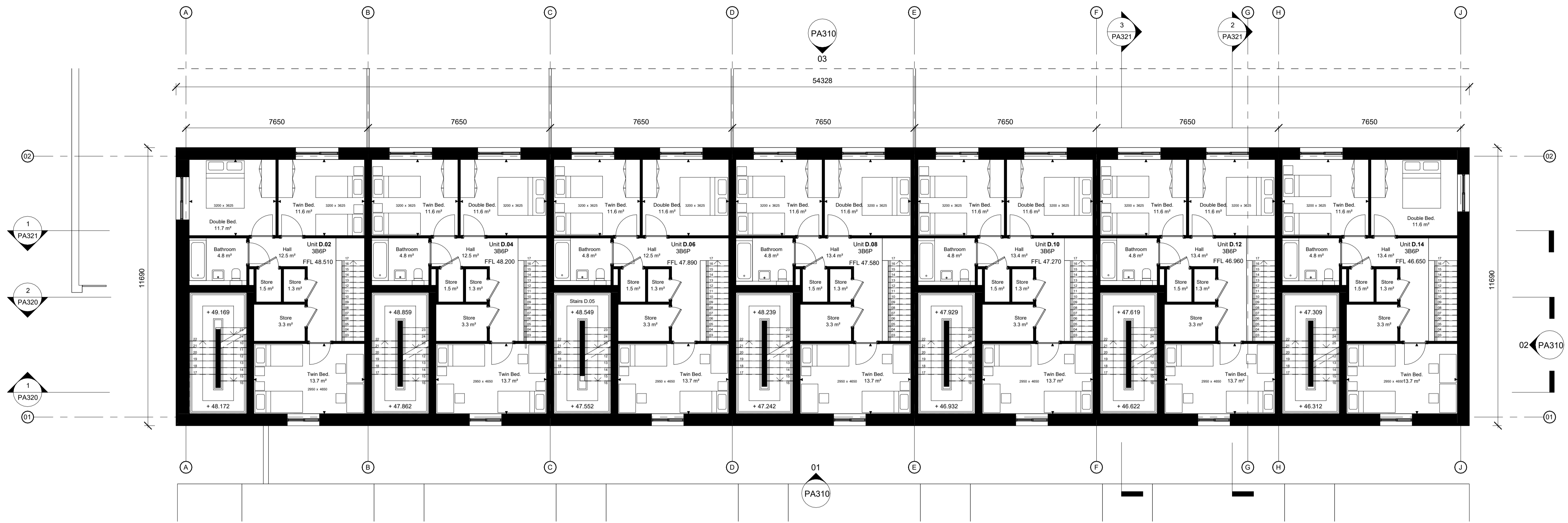
2 Block D _ Level 01 1 : 100