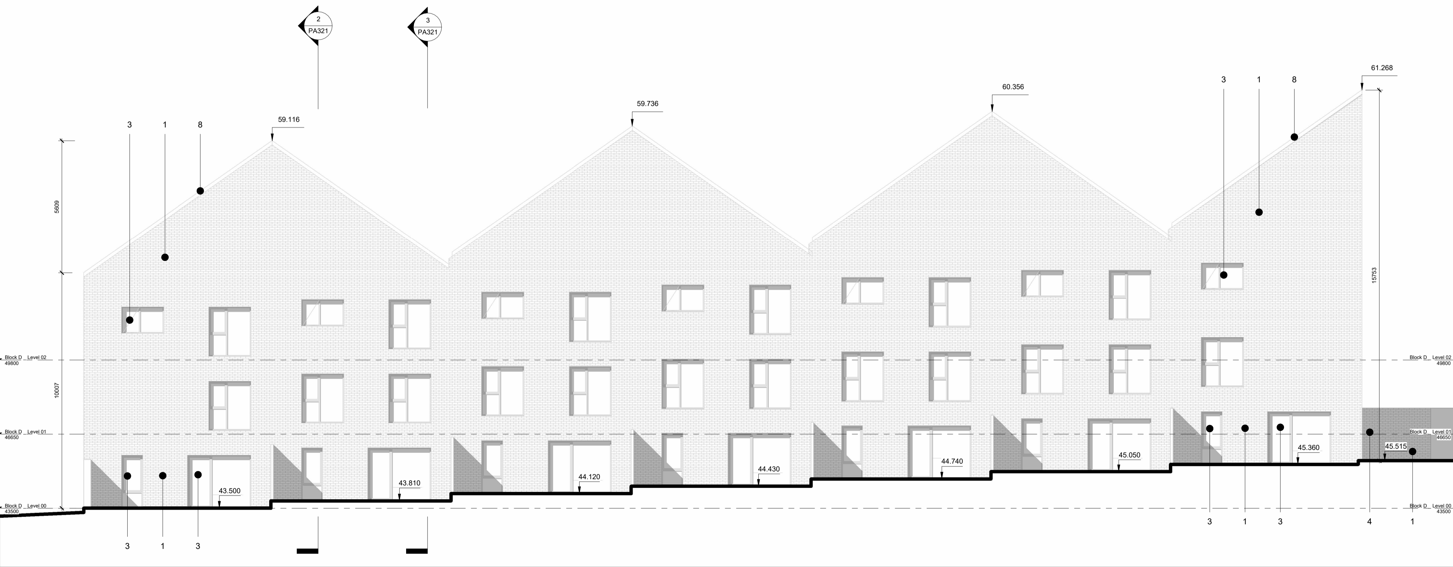
03 Block D - North Elevation 1 : 100