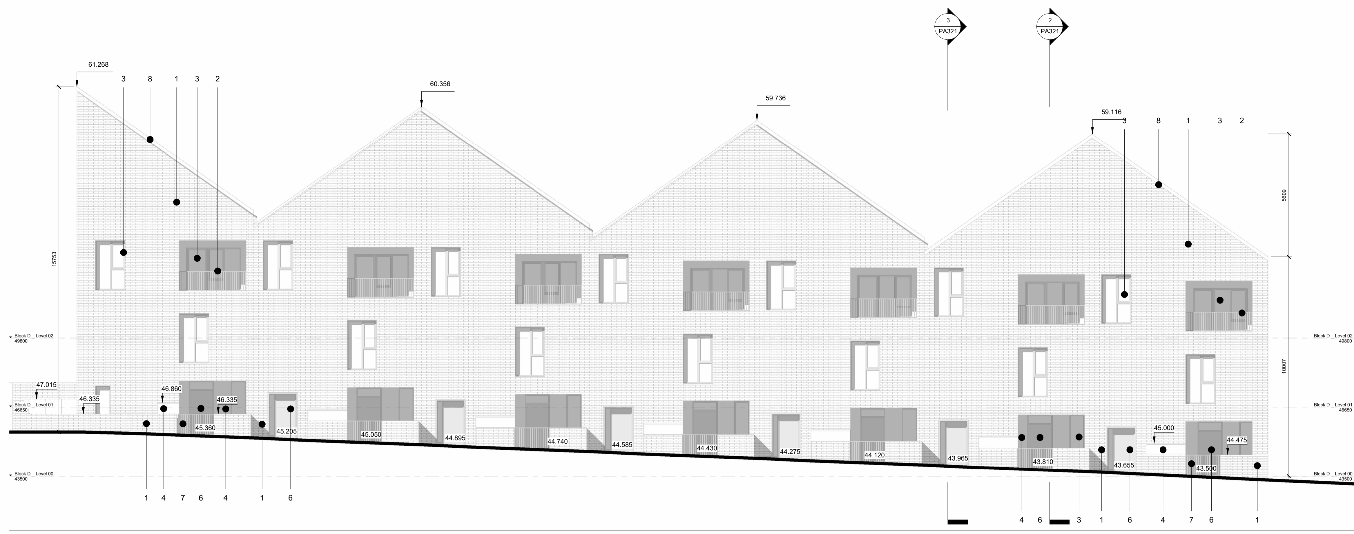
01 Block D - South Elevation 1 : 100