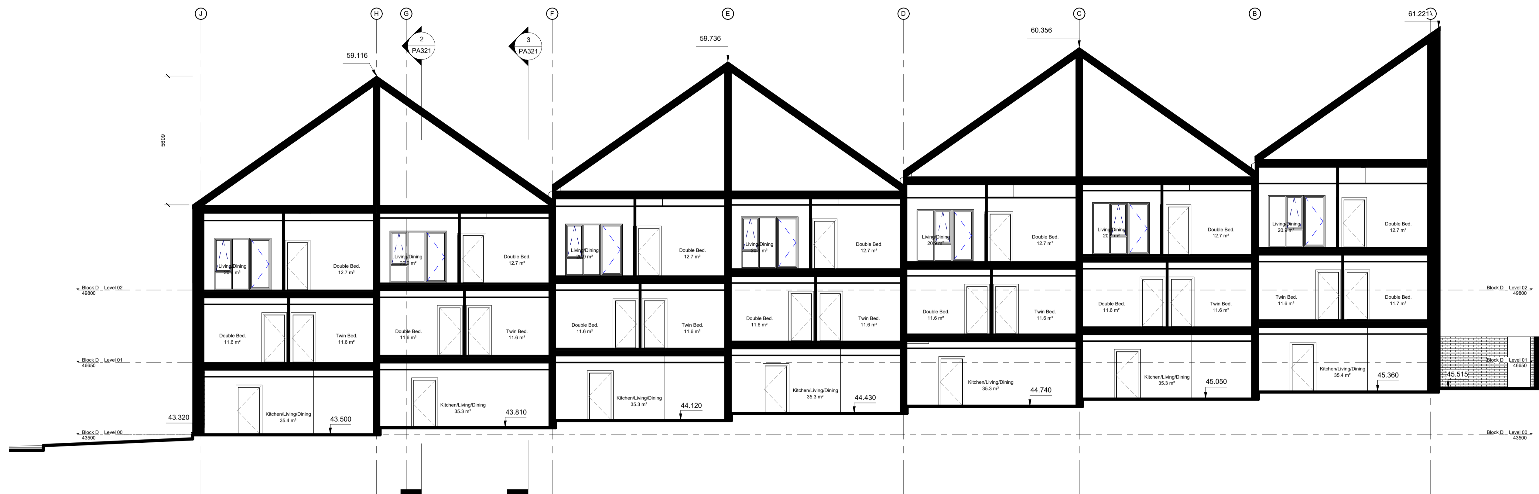
1 Block D - Section 3-3 1 : 100