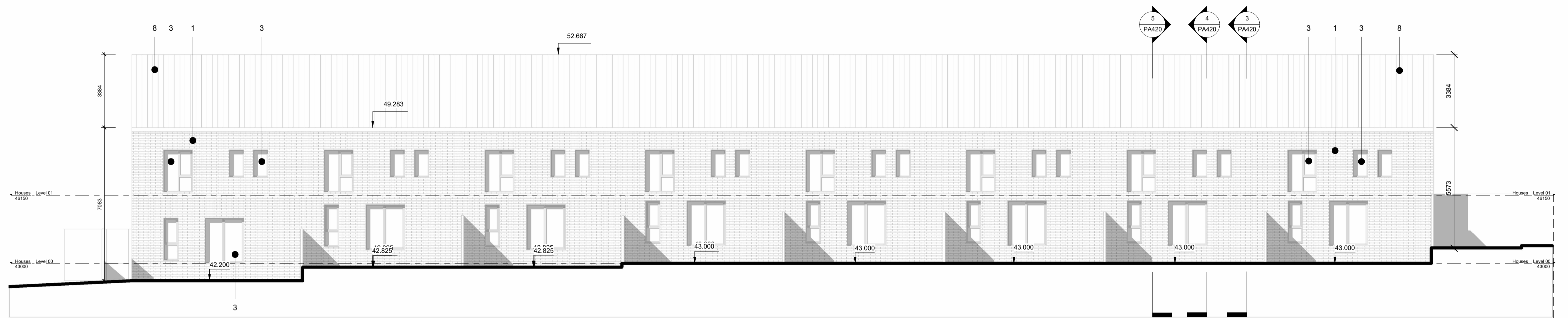
02 Houses - West Elevation