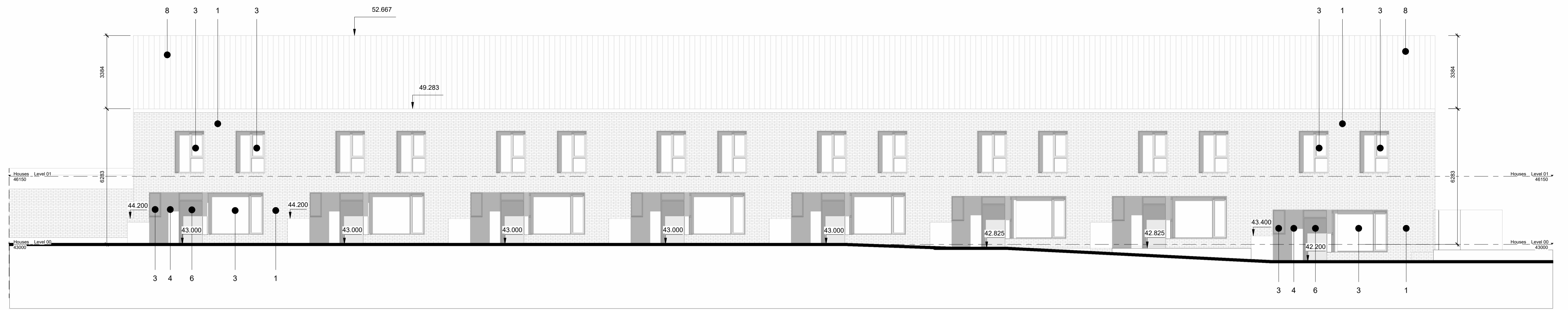
01 Houses - East Elevation