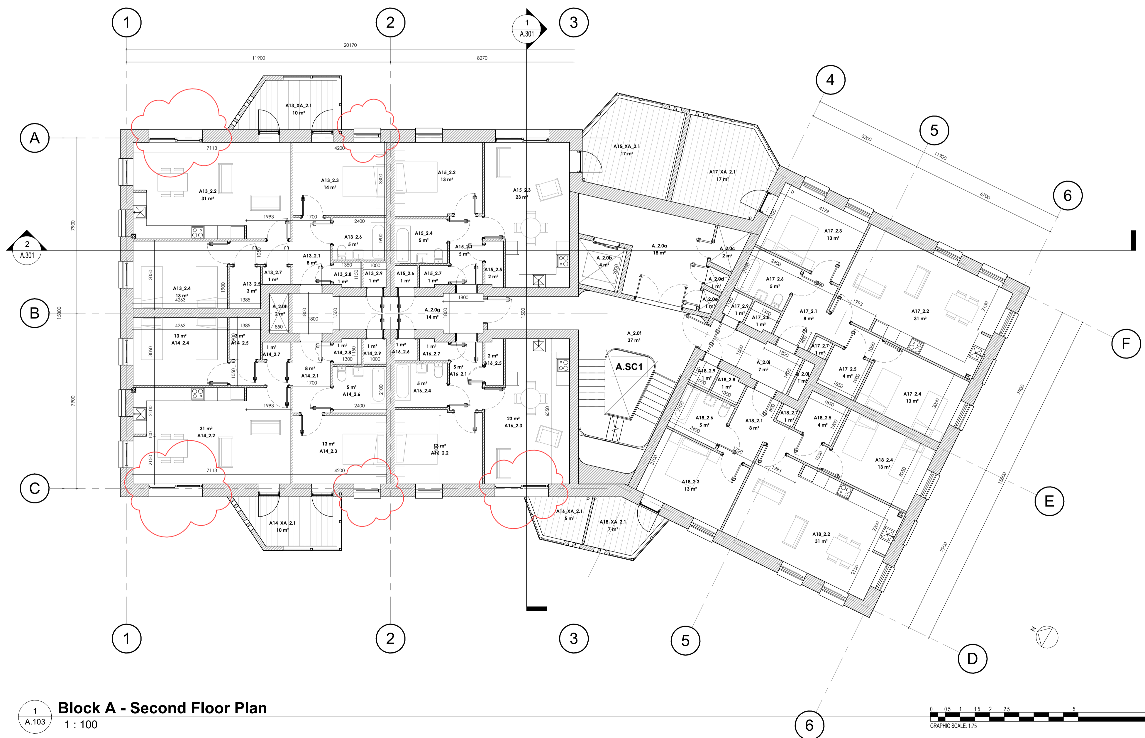
1 A.103 Block A - Second Floor Plan 1 : 100