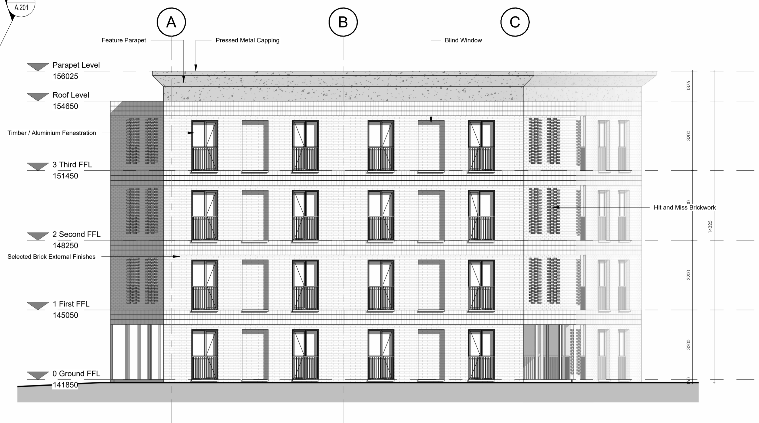
1 A.201 North Elevation 1 : 100 GRAPHIC SCALE: 1:100