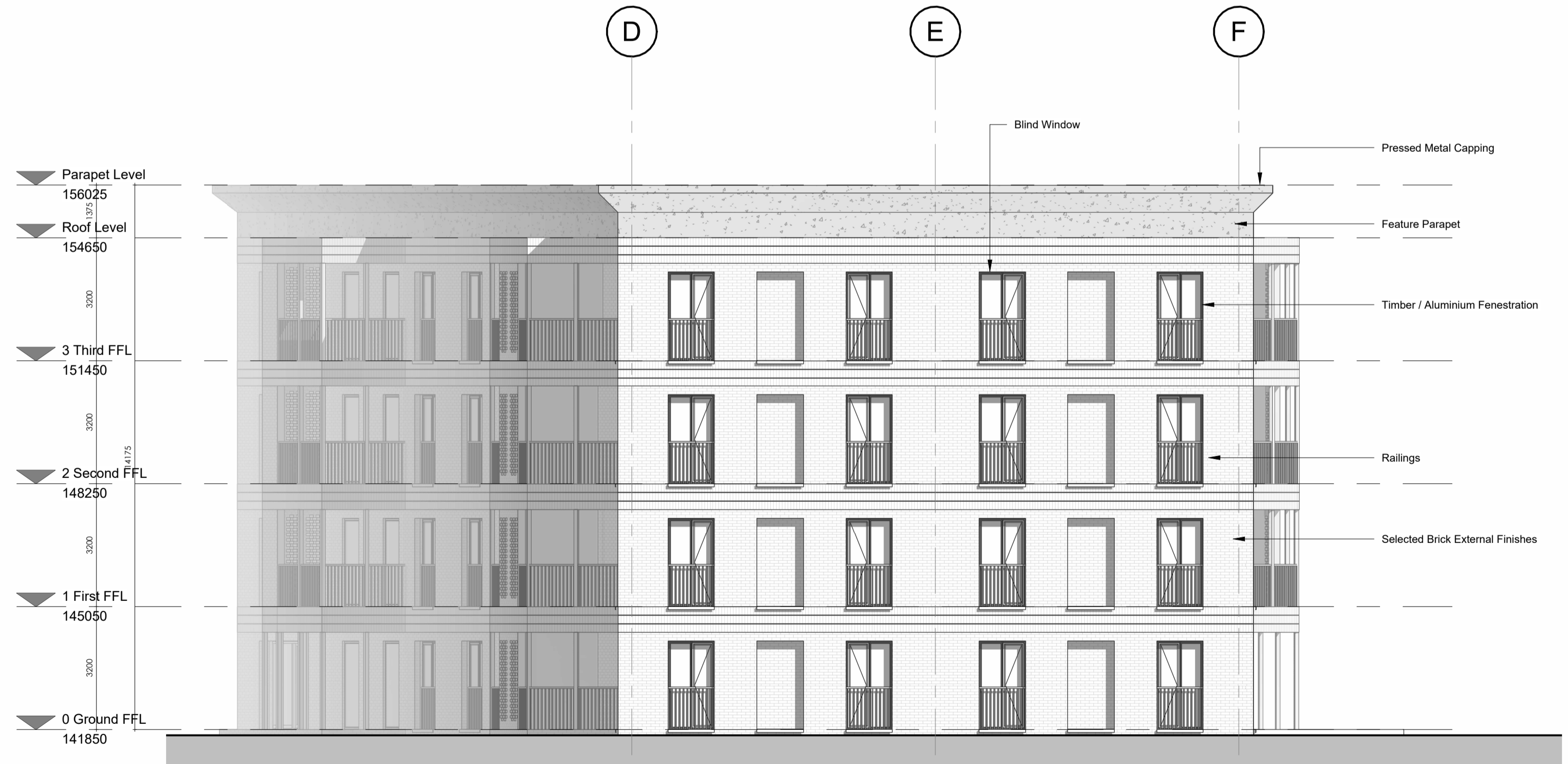
2 A.201 South Elevation 1 : 100 GRAPHIC SCALE: 1:100