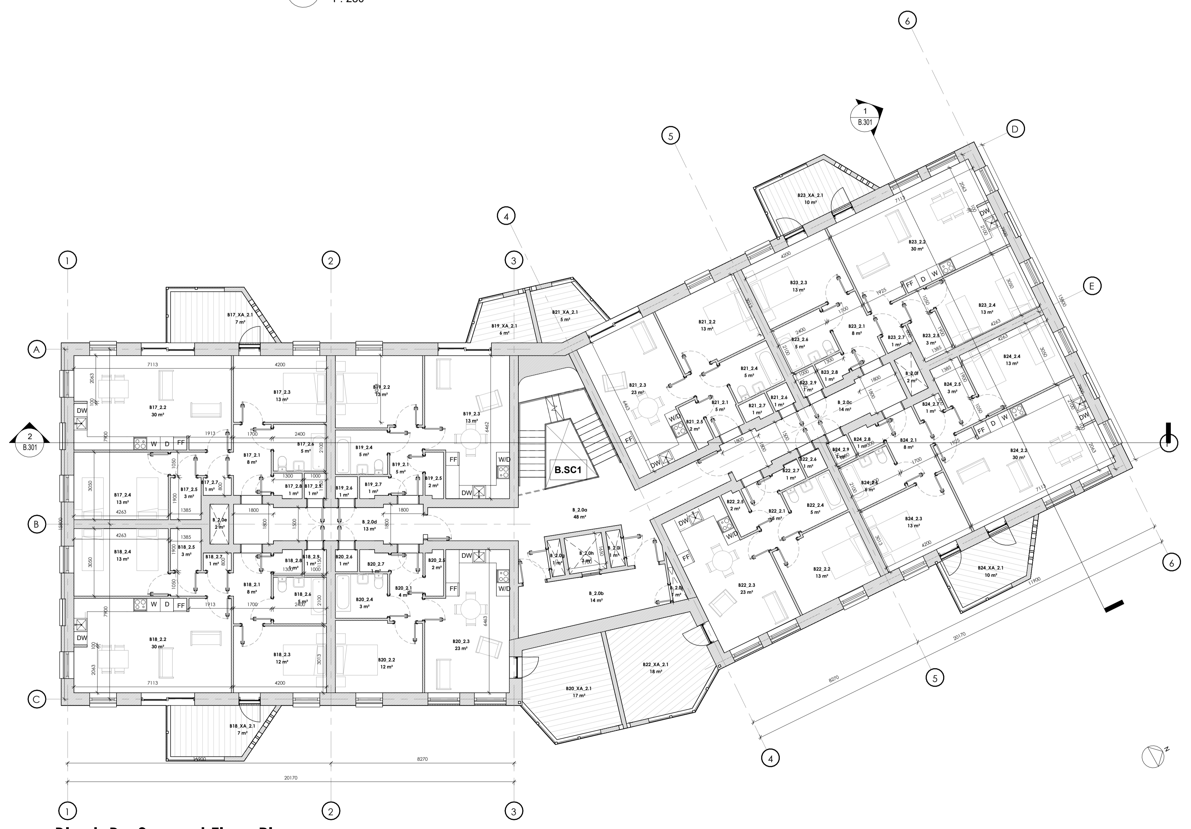
1 Block B - Second Floor Plan 1 : 100 0 1000 2000 5000 SCALE: 1:100