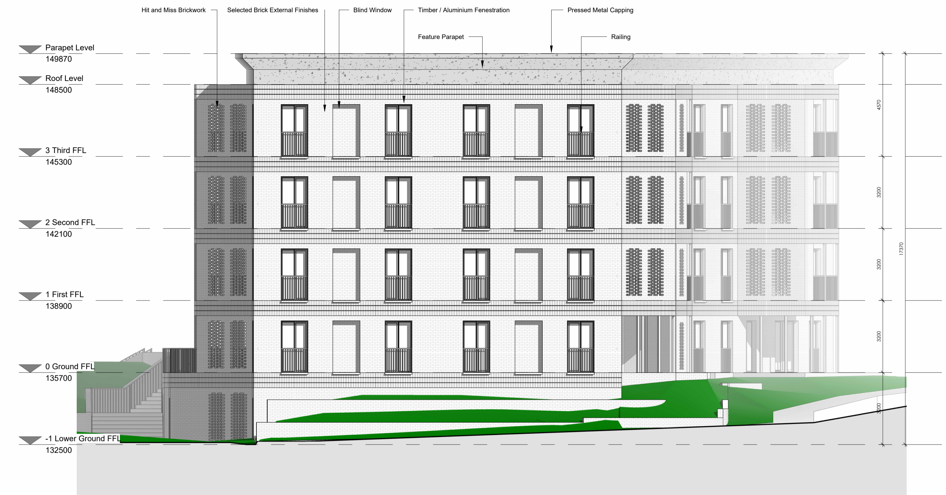
1 North Elevation 1 : 100