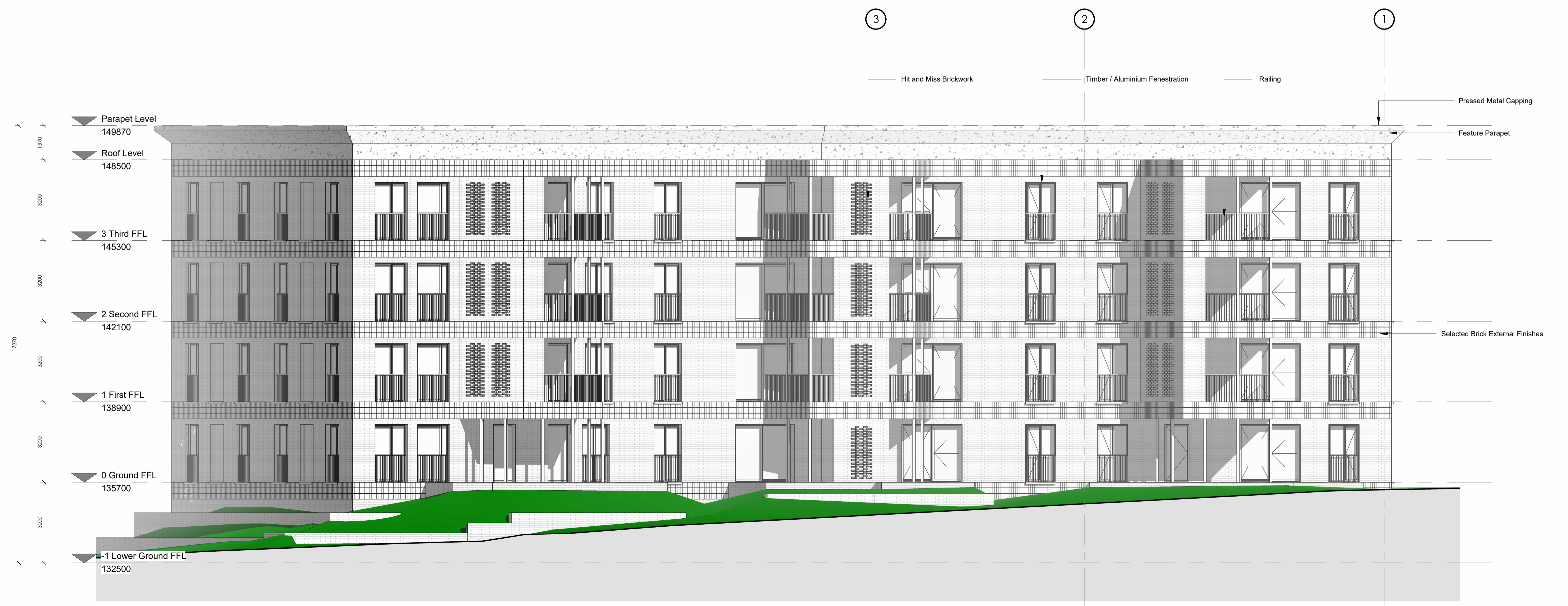
2 West Elevation B.201 1 : 100