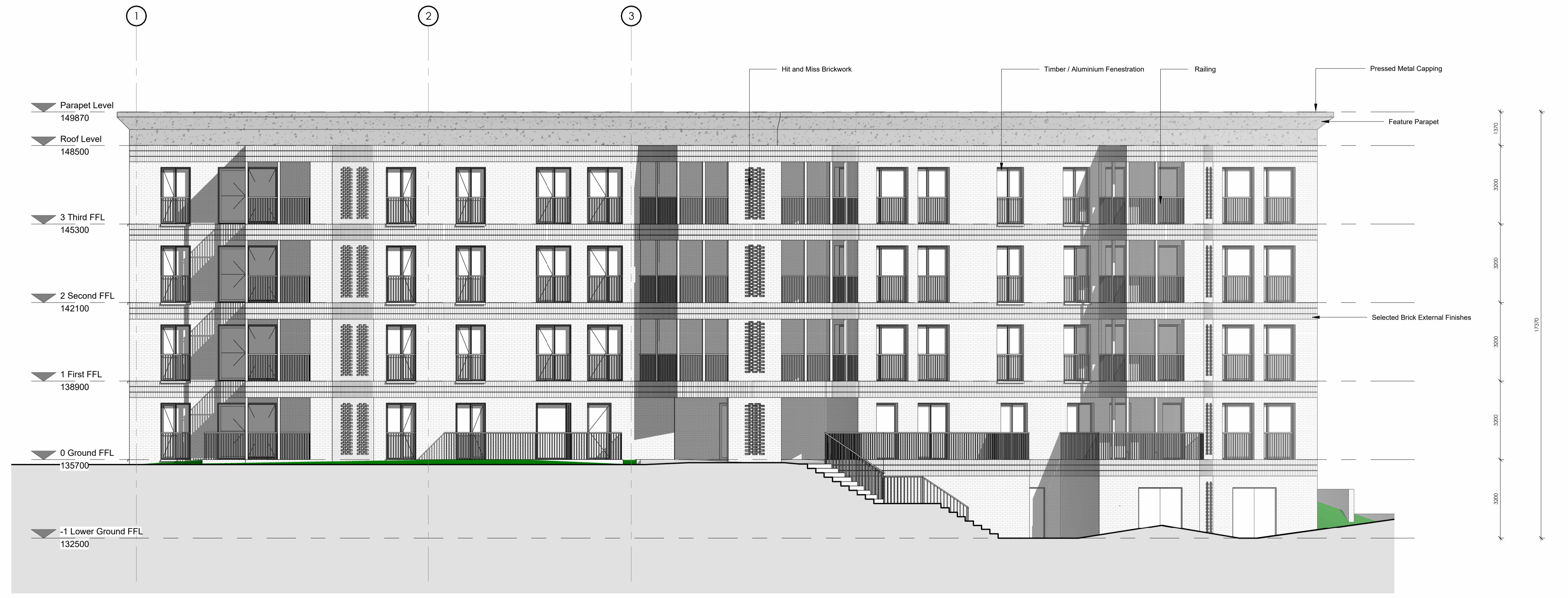
East Elevation 1 : 100