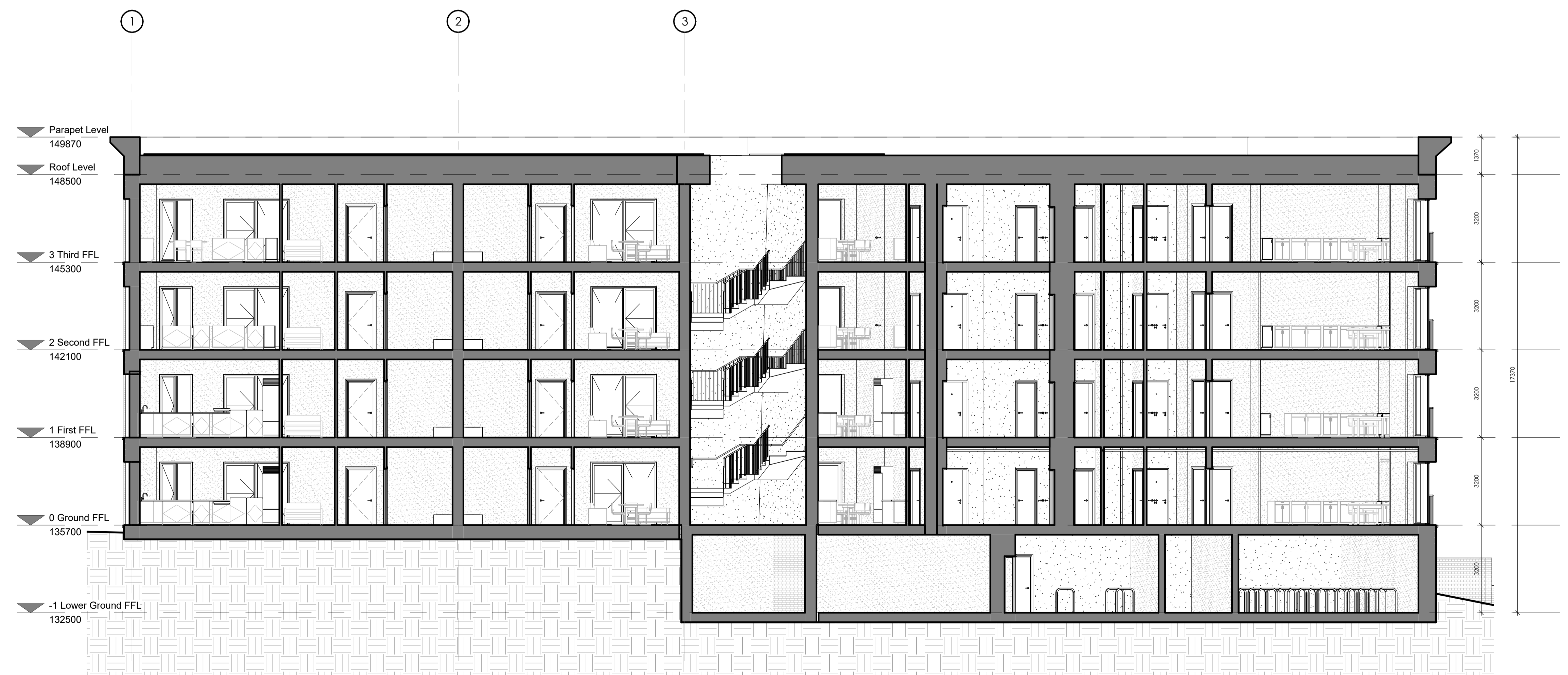
Block B - Section 3 2 B.301 1 : 100

This drawing has been prepared for the following purpose only: Part 8 Submission