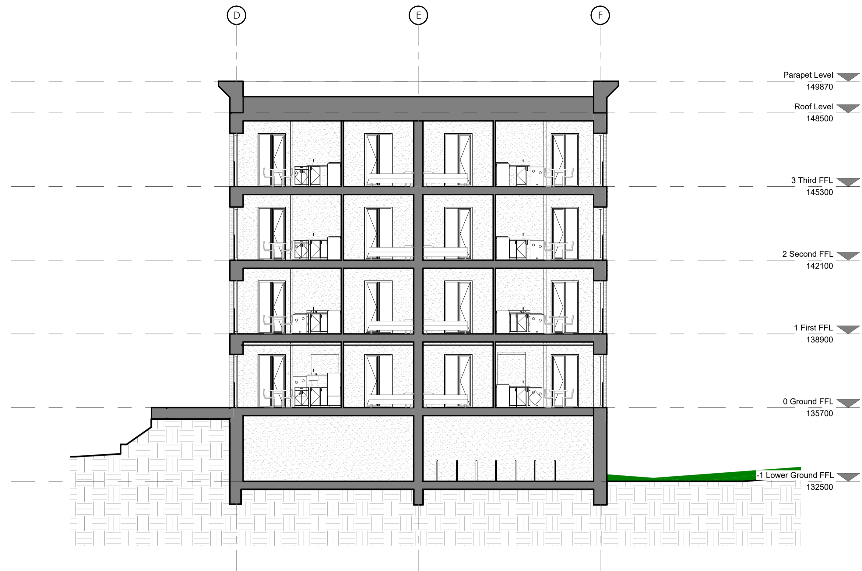
Block B - Section 2 1 B.301 1 : 100