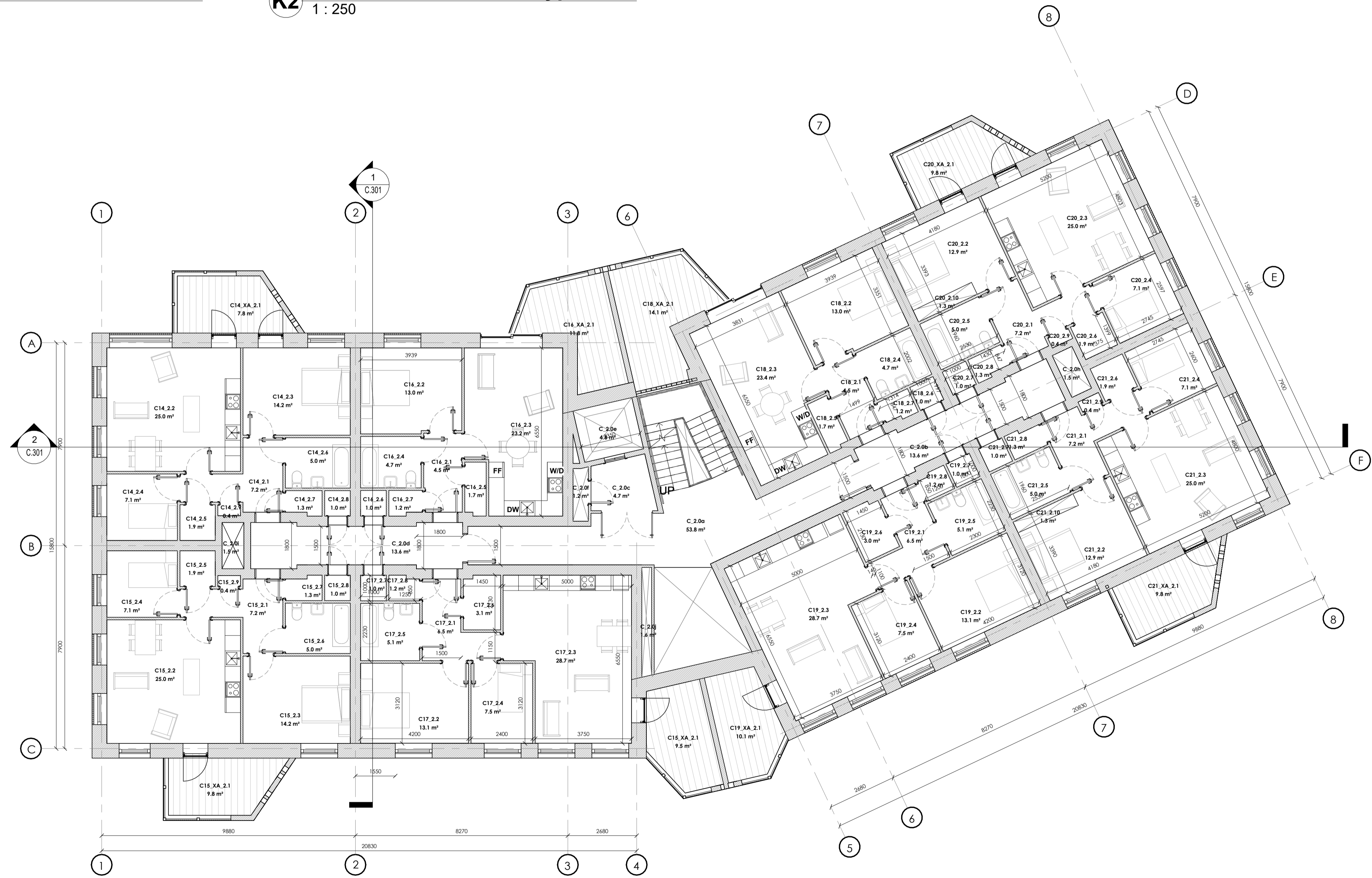
1 Block C - Second Floor Plan 1 : 100