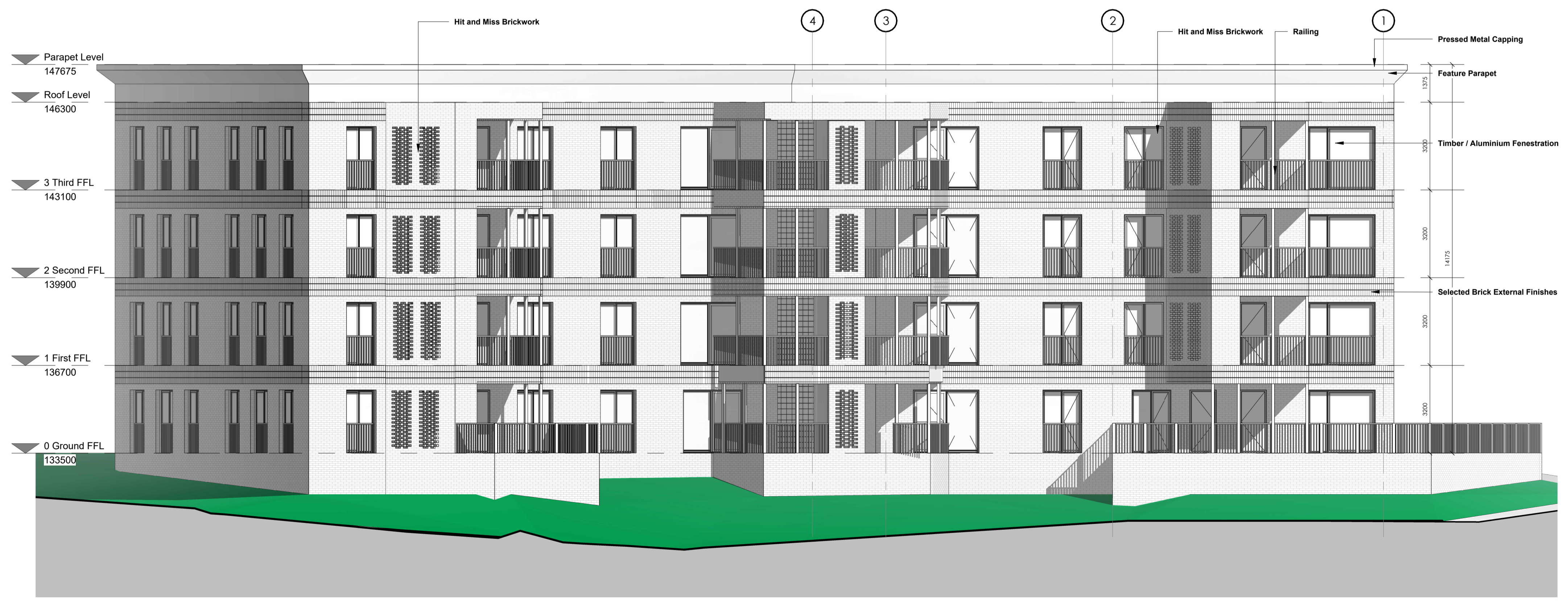
2 North Elevation 2 : 100