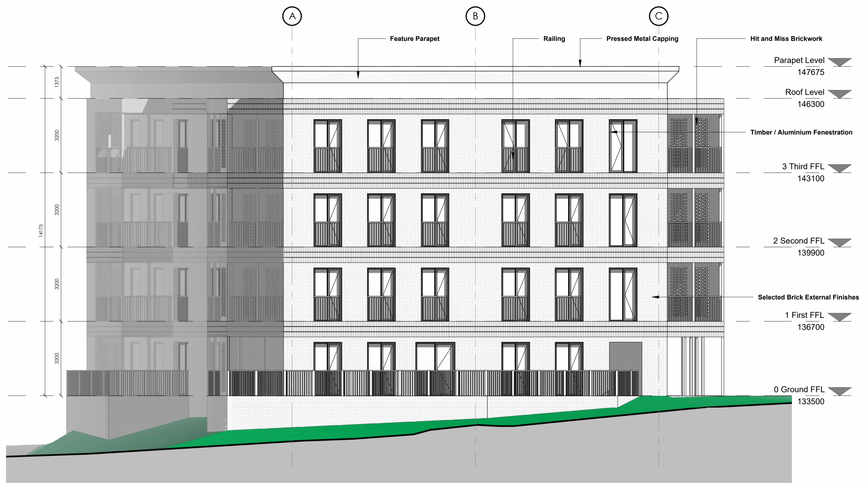
1 West Elevation 1 : 100