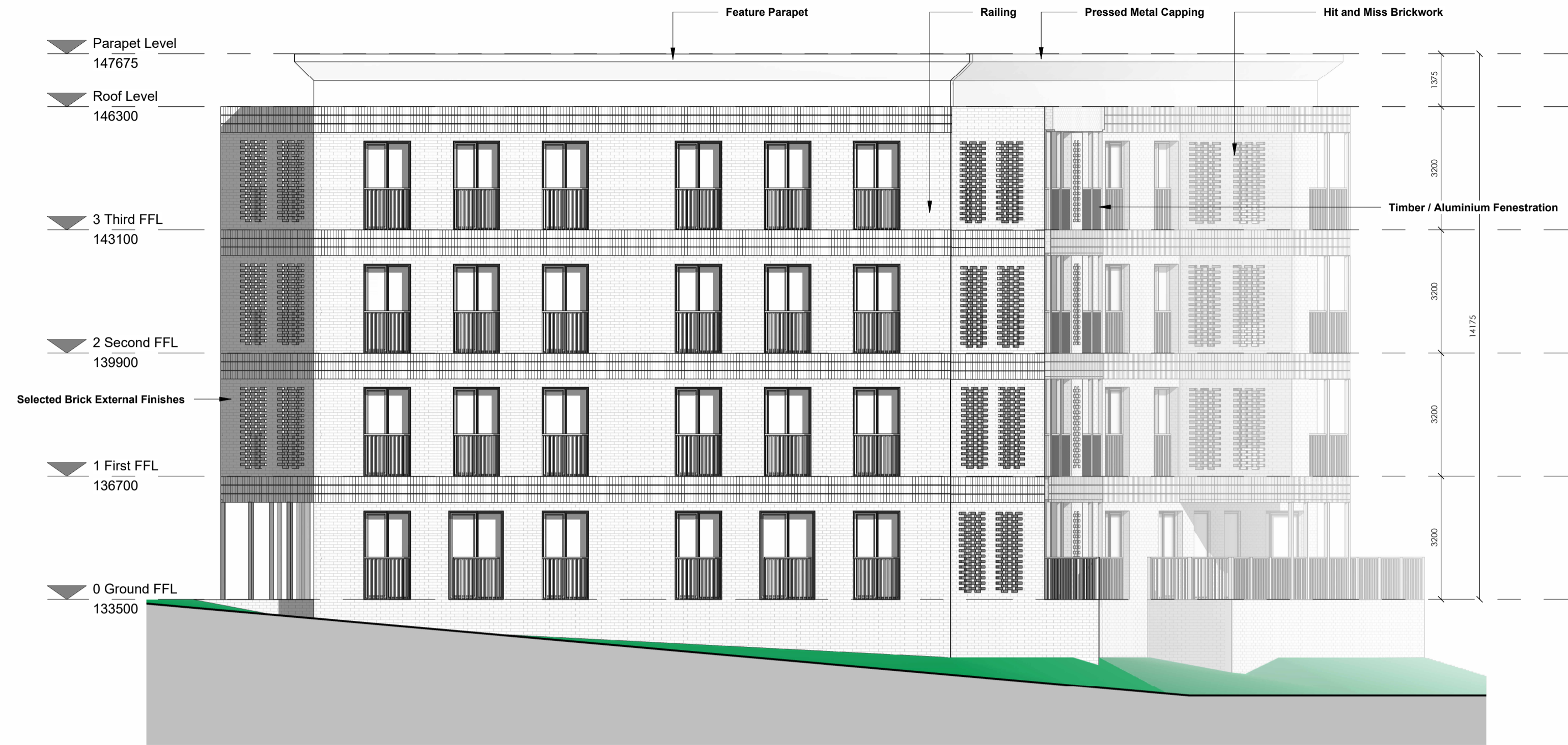
1 East Elevation 1 : 100