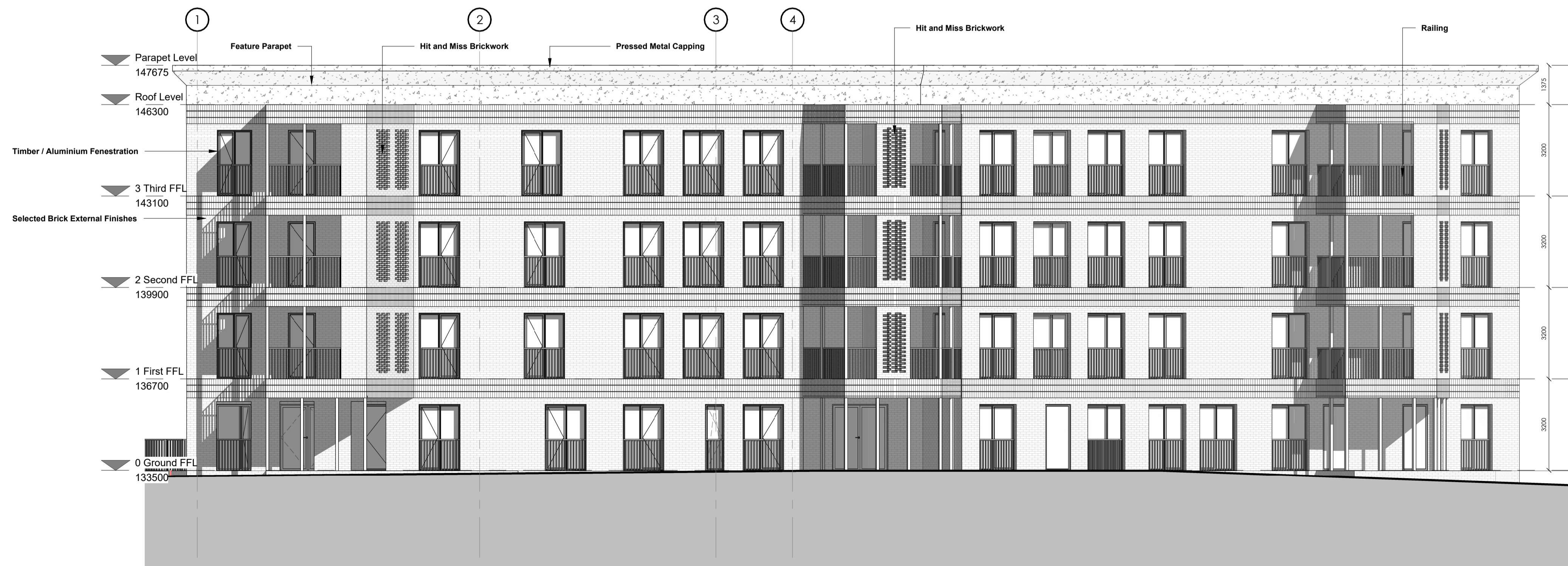
2 South Elevation 1 : 100