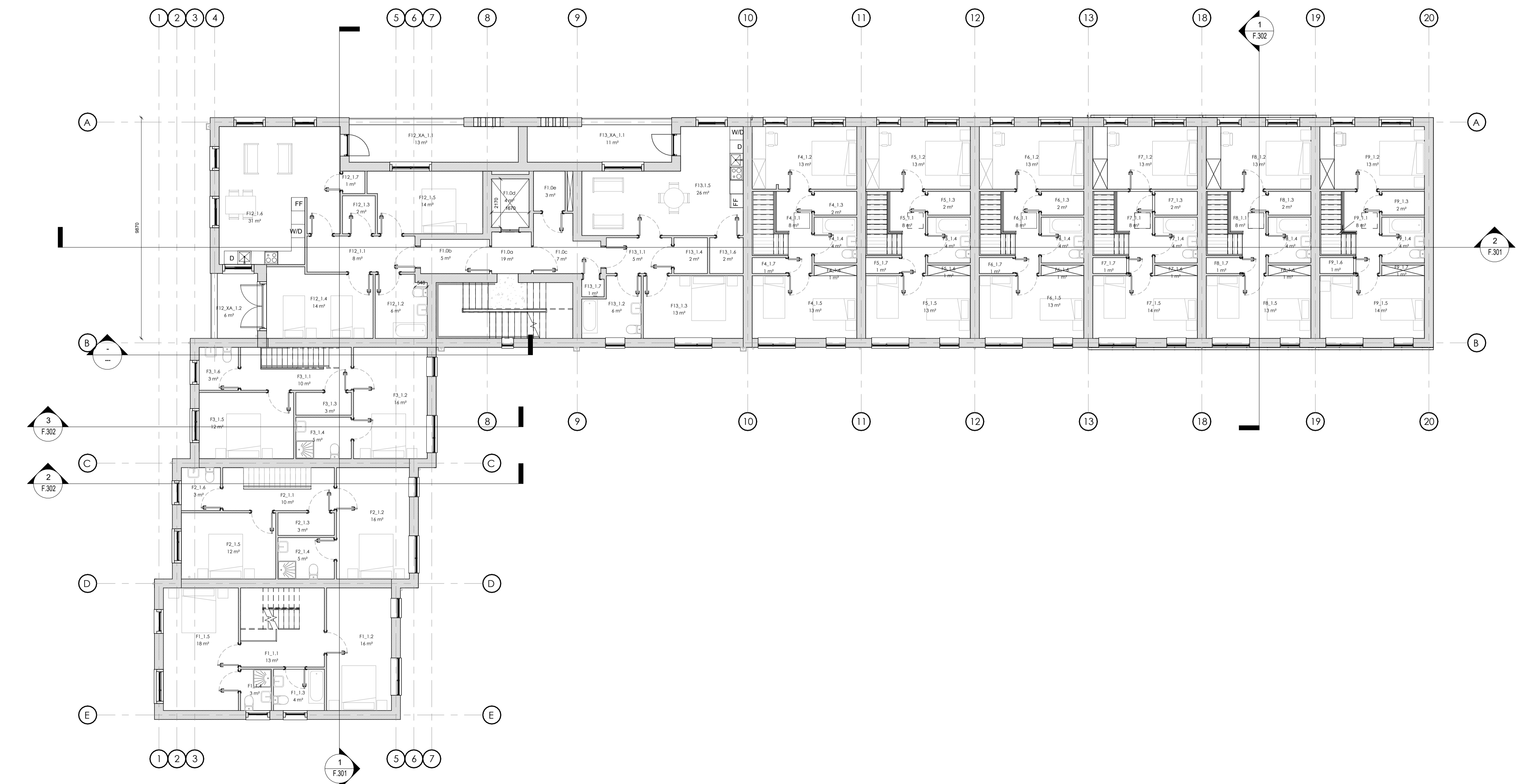
1 Block F - First Floor Plan 1 : 100