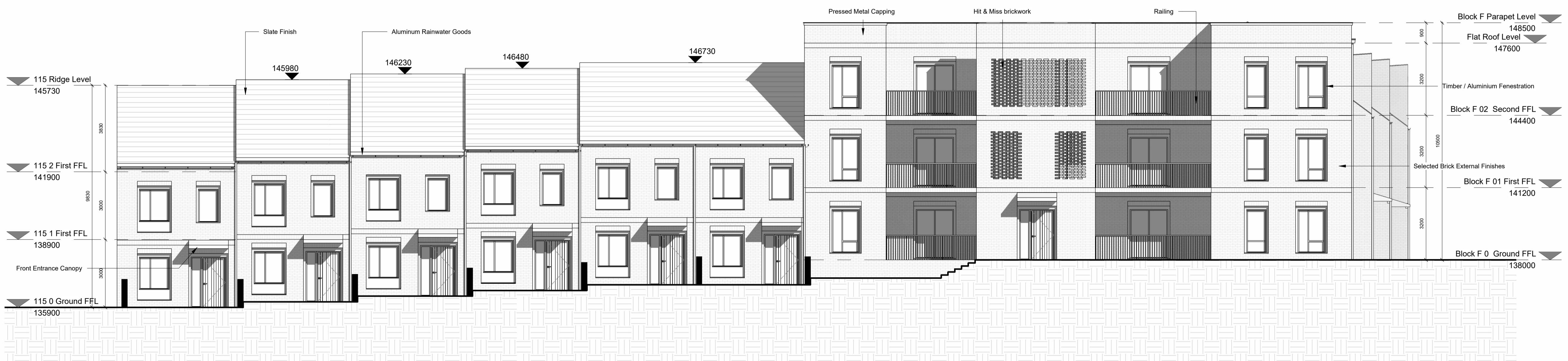
2 Block F - North Elevation 1 : 100