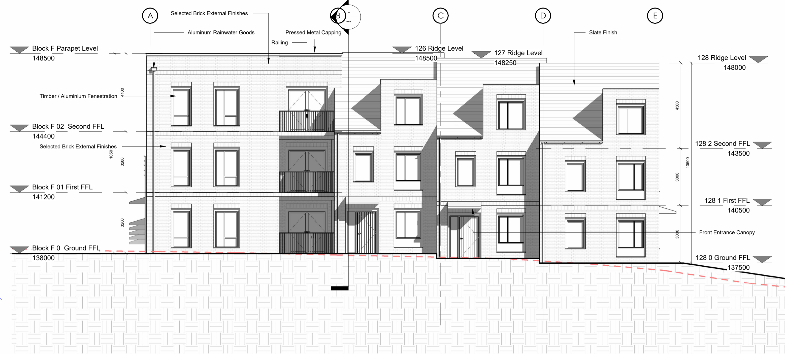
1 Block F - West Elevation 1 : 100

This drawing has been prepared for the following purpose only: