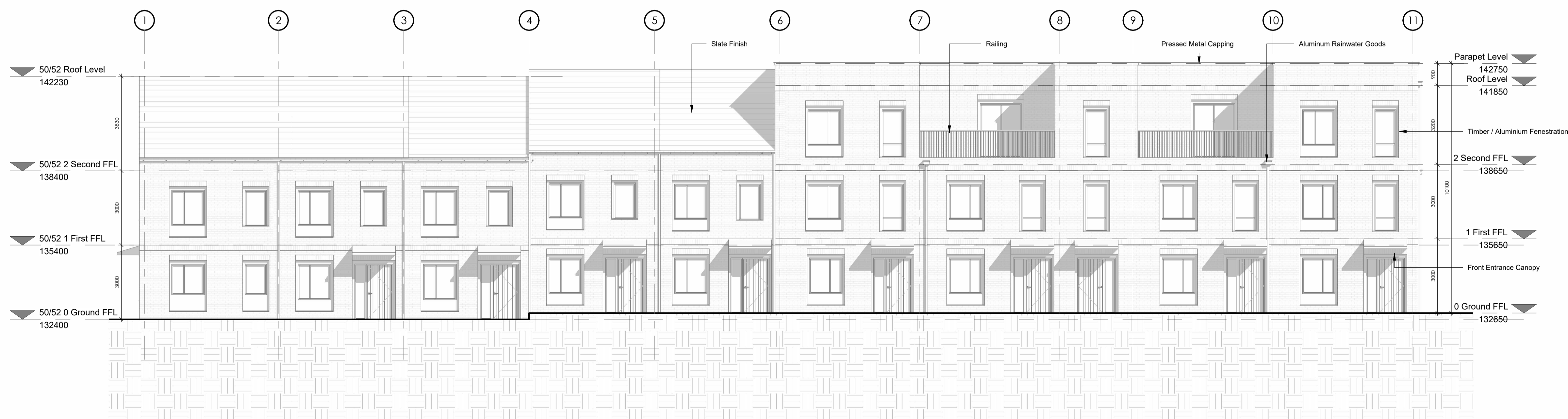
2 East Elevation 1 : 100