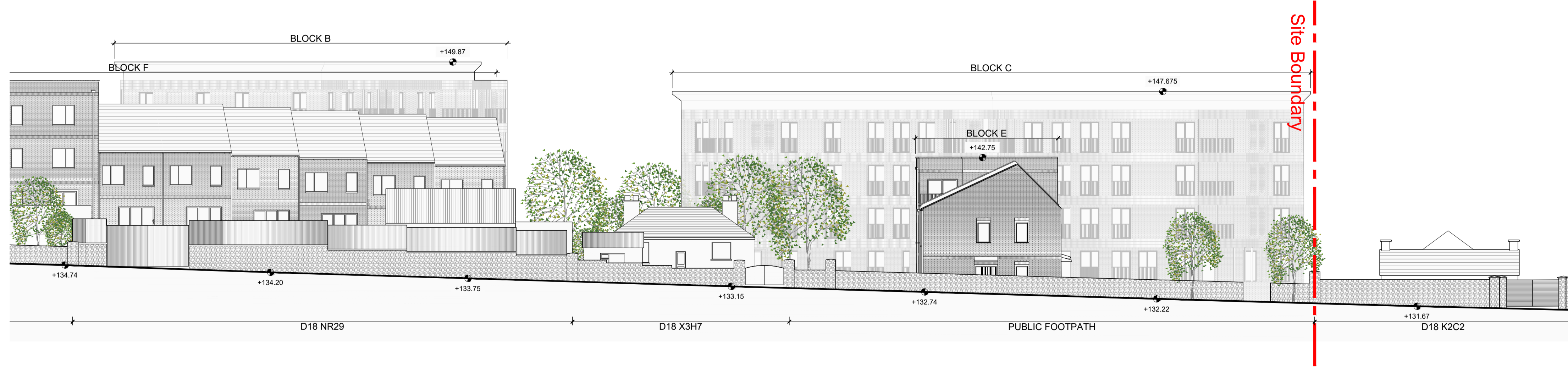
0201 Site Contiguous Elevation: View from Blackglan Road: Part 2 3 1:200 @ A1 / 1:400 @ A3

Refer to DRG No. BGR-ARCH-ZZ-ZZ-DR-A-0201 Drawing No. 2 ('Part 1') for further detail of western contiguous elevation.