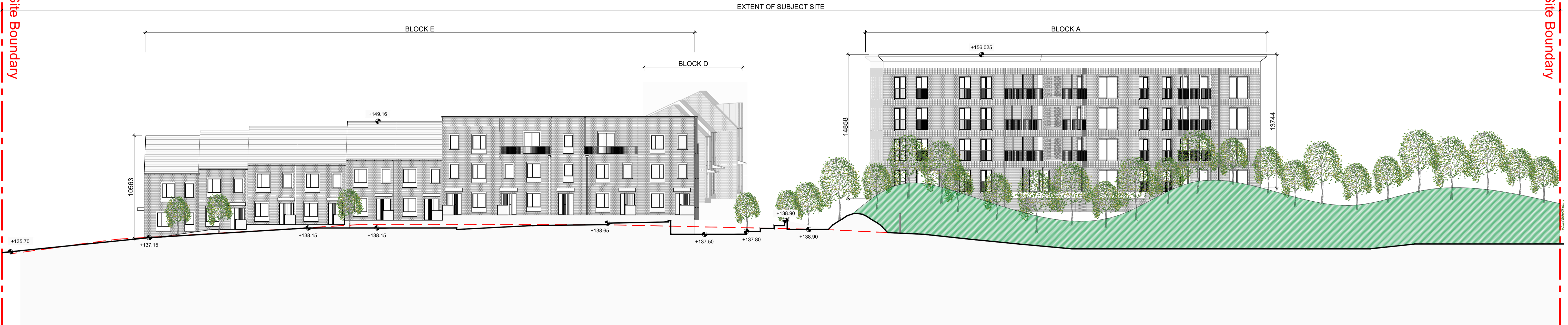
0303 Site Section: Proposed 3-3 2 1:200 @ A1 / 1:400 @ A3