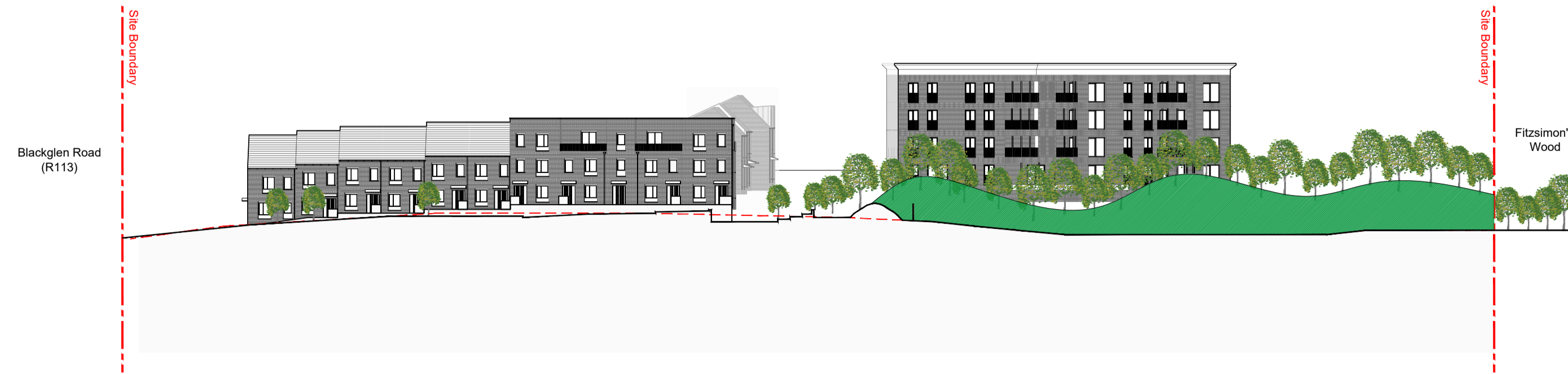
0303 Site Section: Proposed 3-3 1 1:500 @ A1 / 1:1000 @ A3