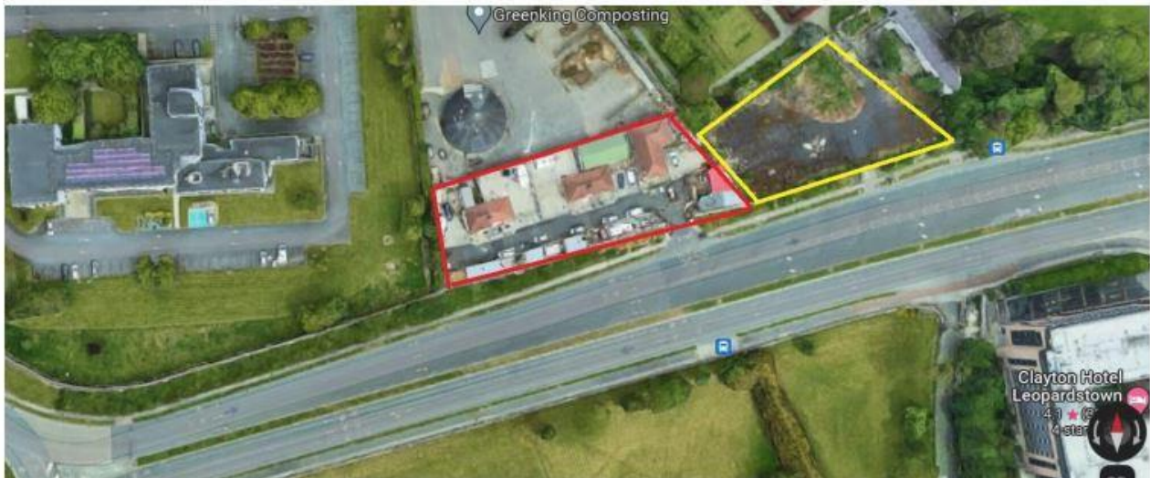
Figure 2: Survey area - Burton Park, Leopardstown Road. Eircode D18 EK73.

Burton Park, Leopardstown Road. Eircode D18 EK73 (Red Line & Yellow Line areas).