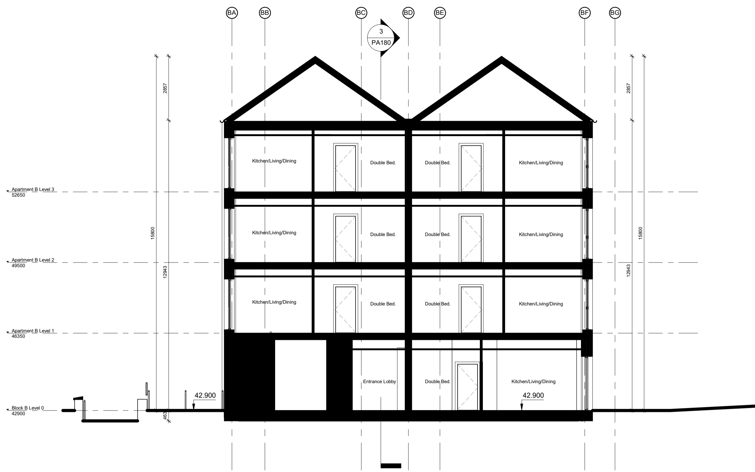
1 Block B - Section 1-1 1 : 100