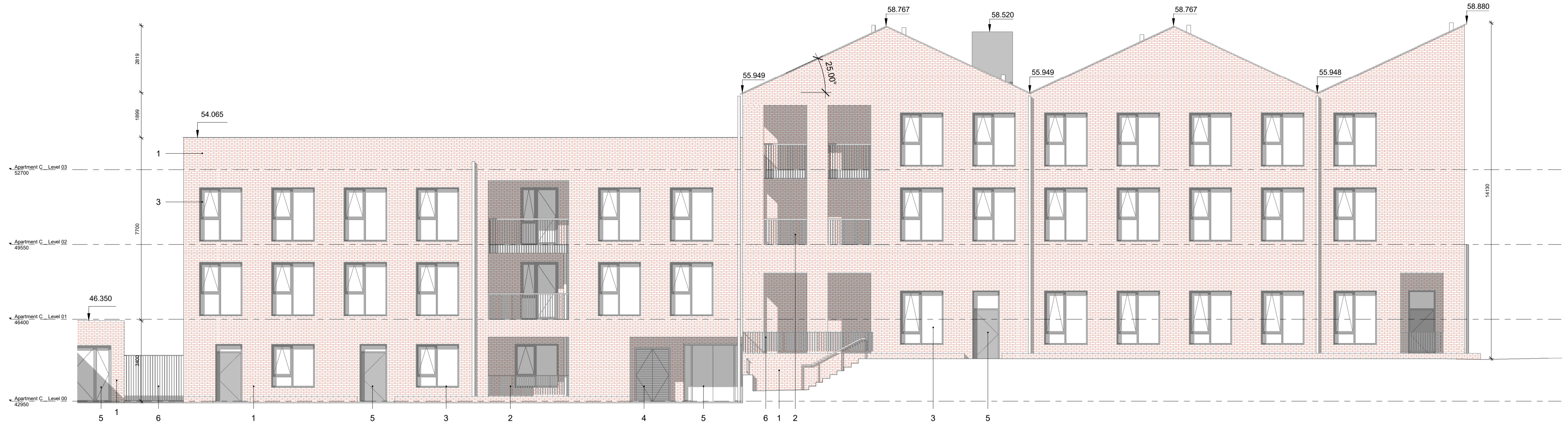
01 Block C - North Elevation 1 : 100