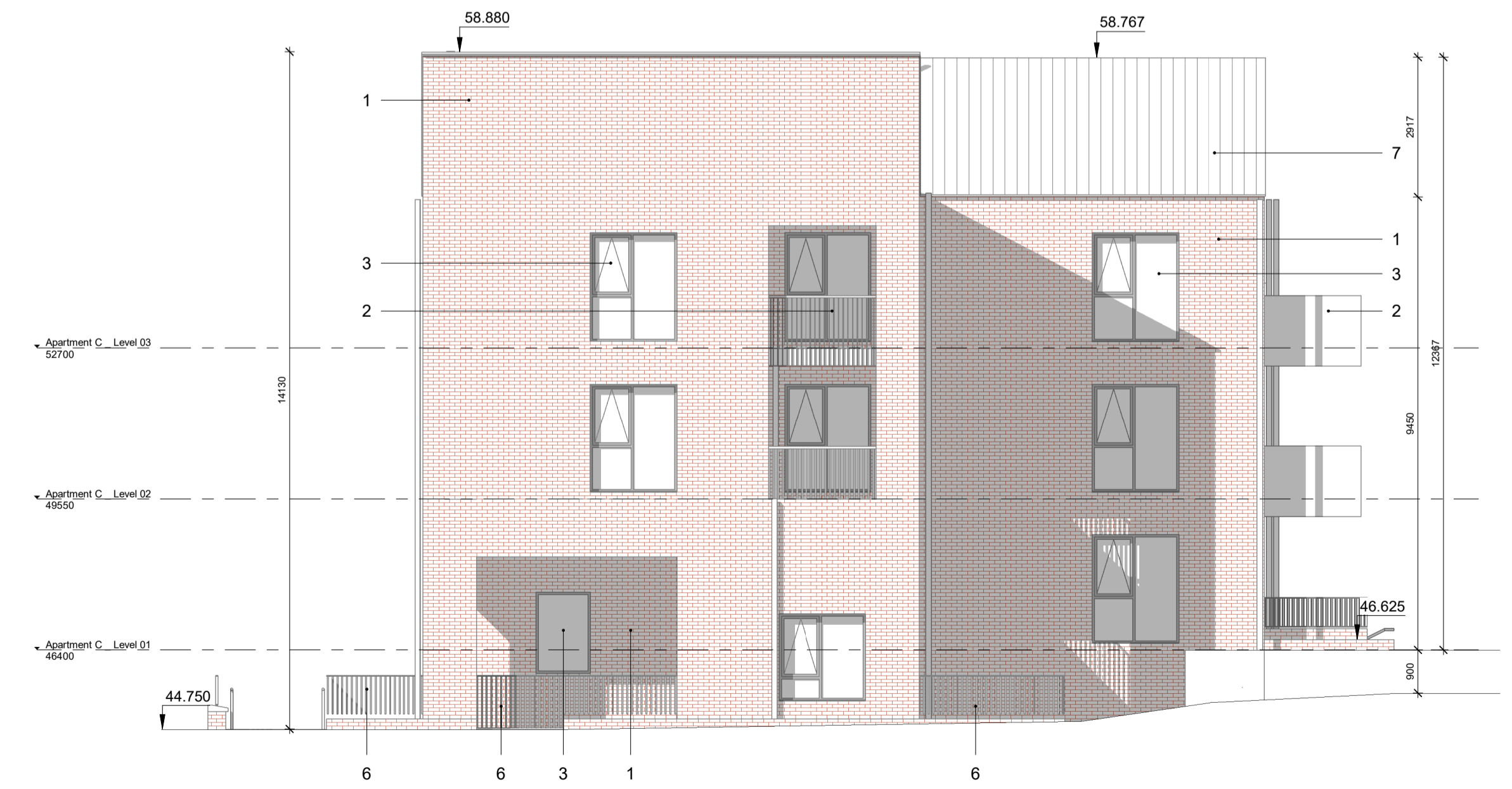
03 Block C - West Elevation 1 : 100