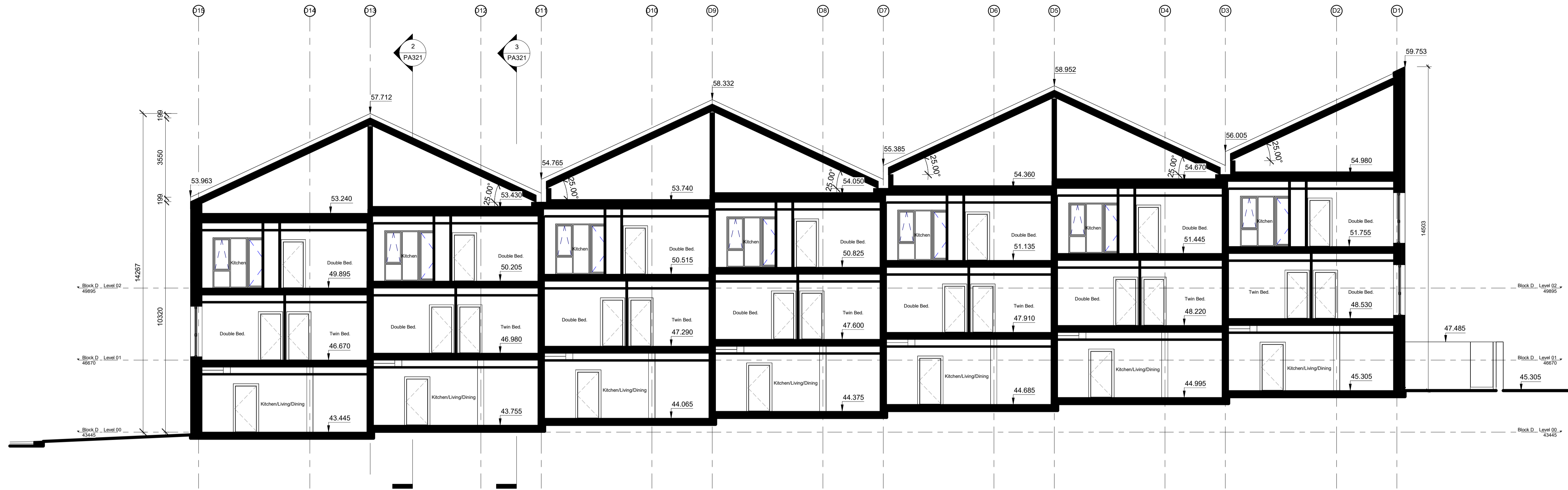
1 Block D - Section 3-3 1: 100