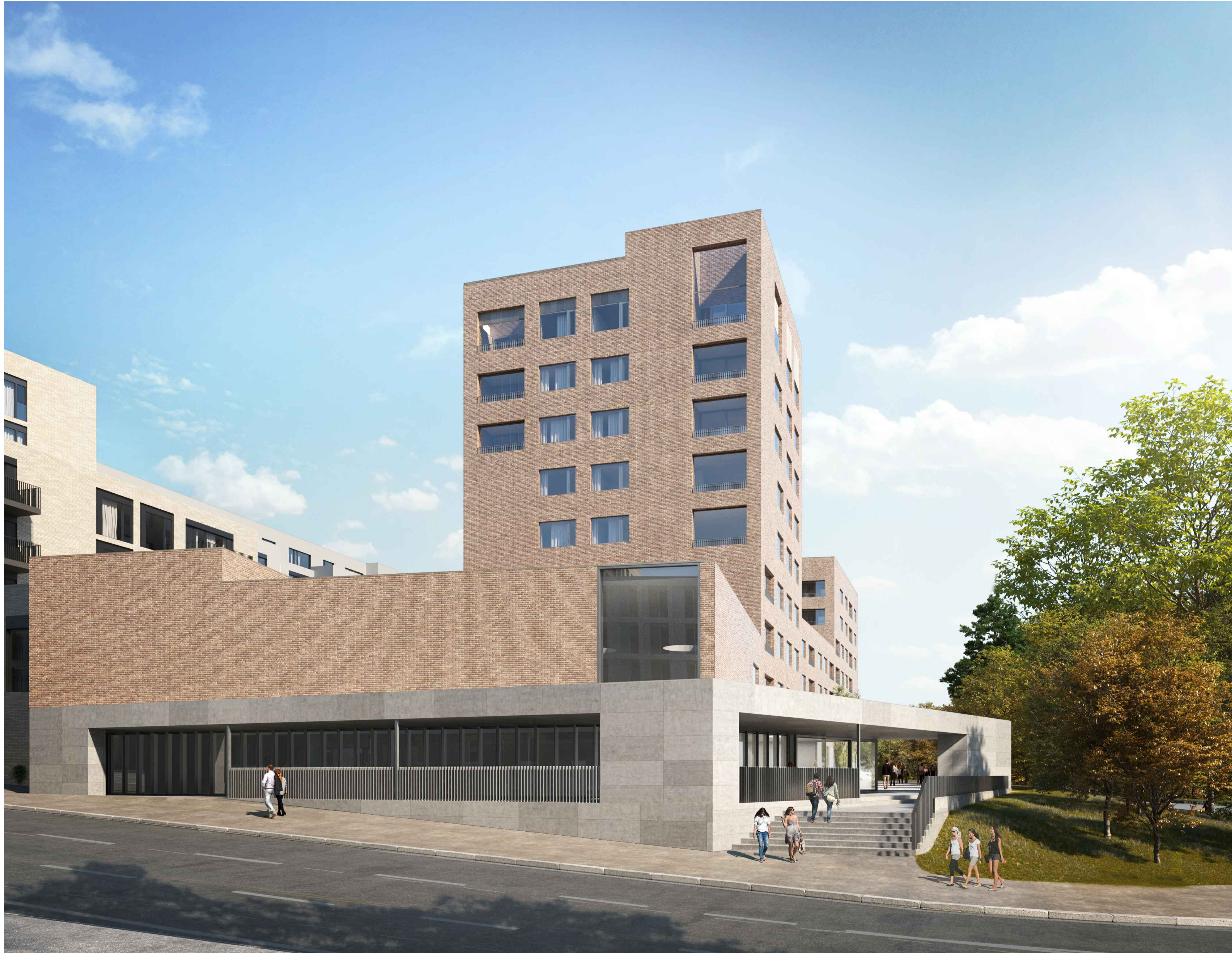
VIEW OF LIBRARY ENTRANCE FROM N11 JUNCTION