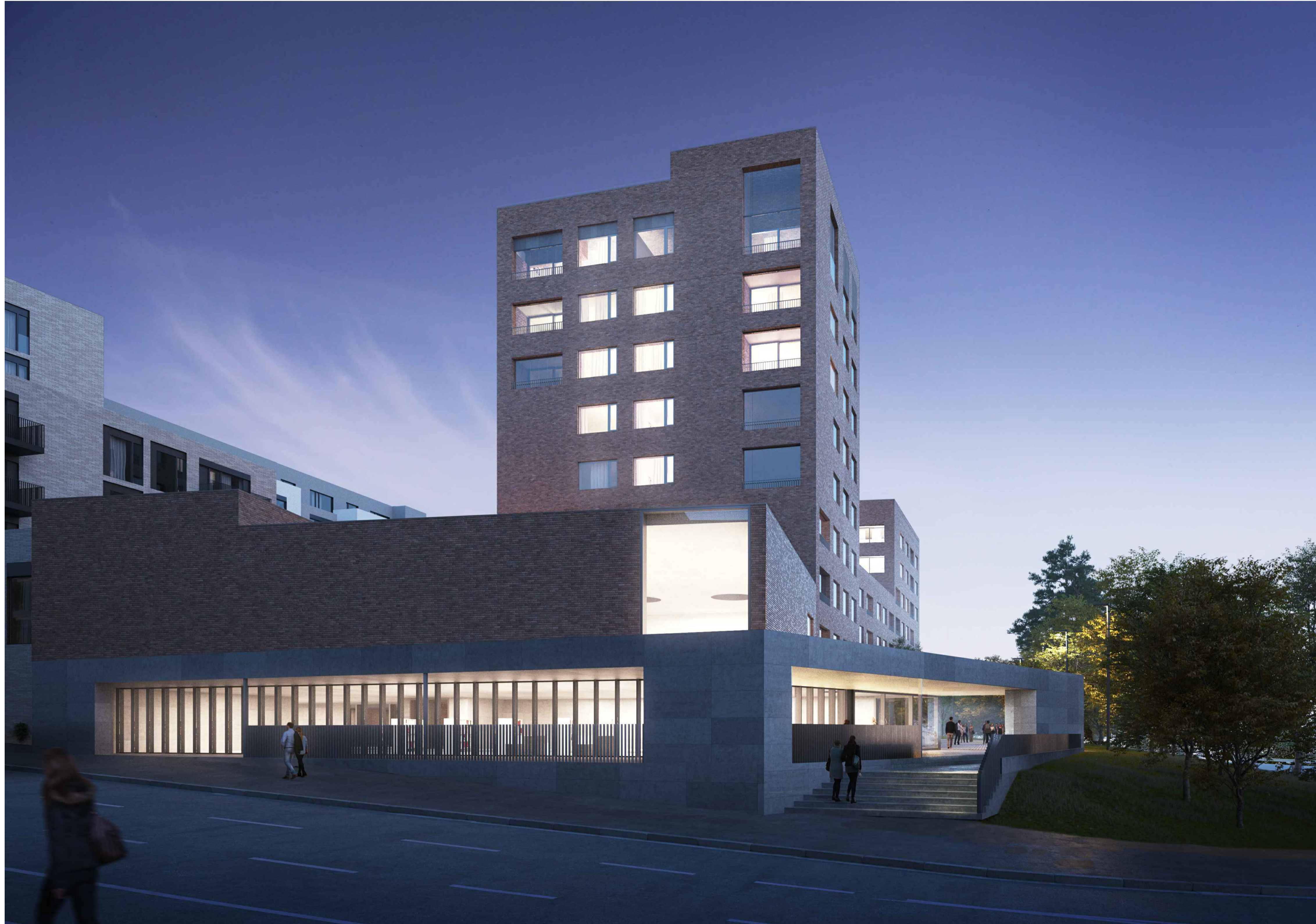
VIEW OF LIBRARY ENTRANCE FROM N11 JUNCTION AT NIGHT