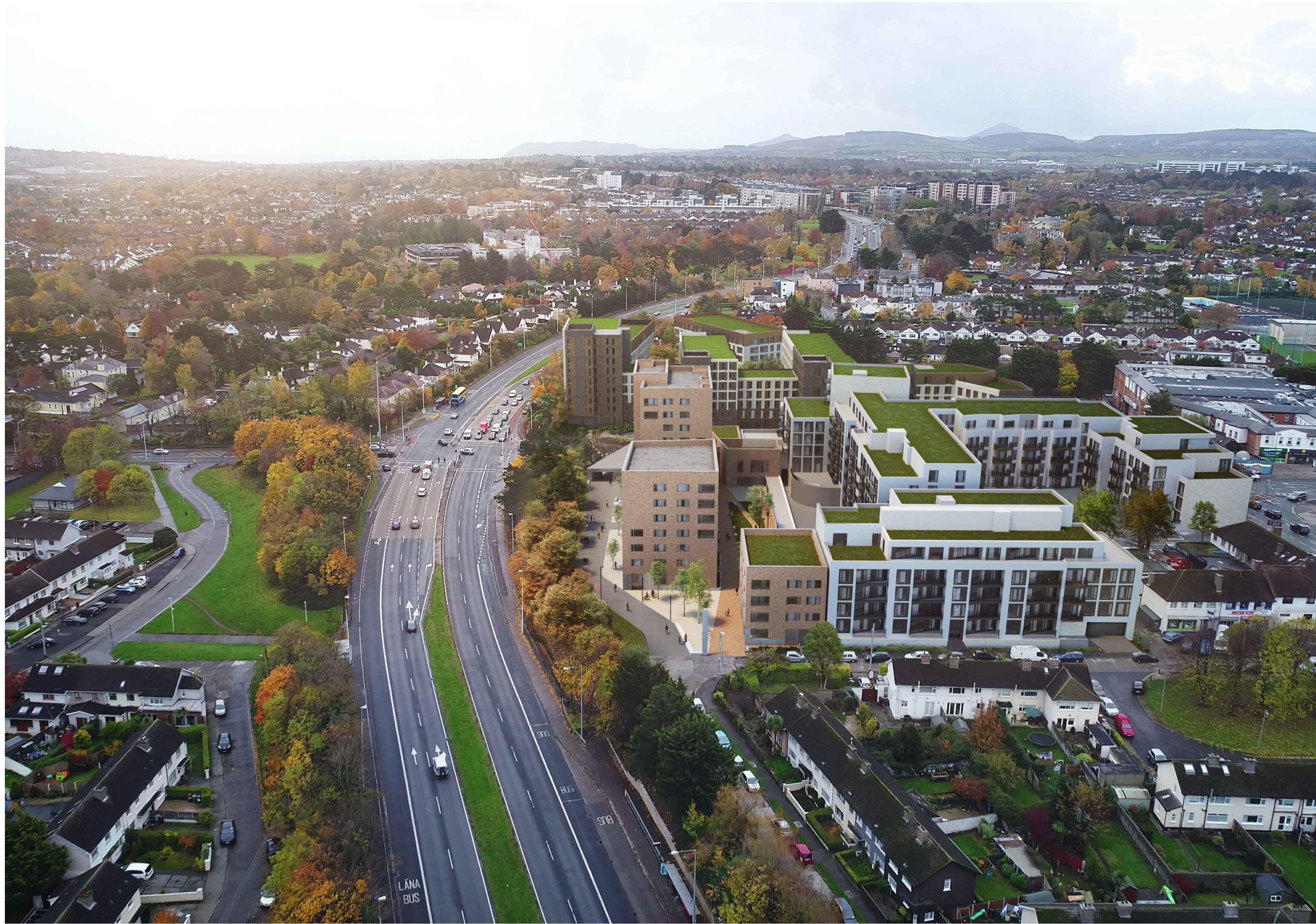
AERIAL VIEW FROM THE NORTH