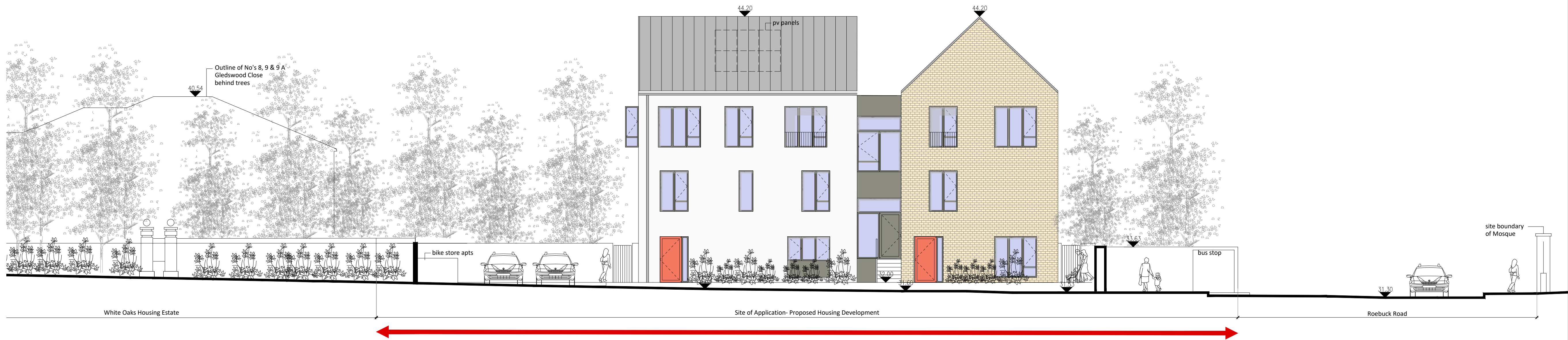
SOUTH-EAST ELEVATION(WHITE OAKS ROAD) SCALE 1:100