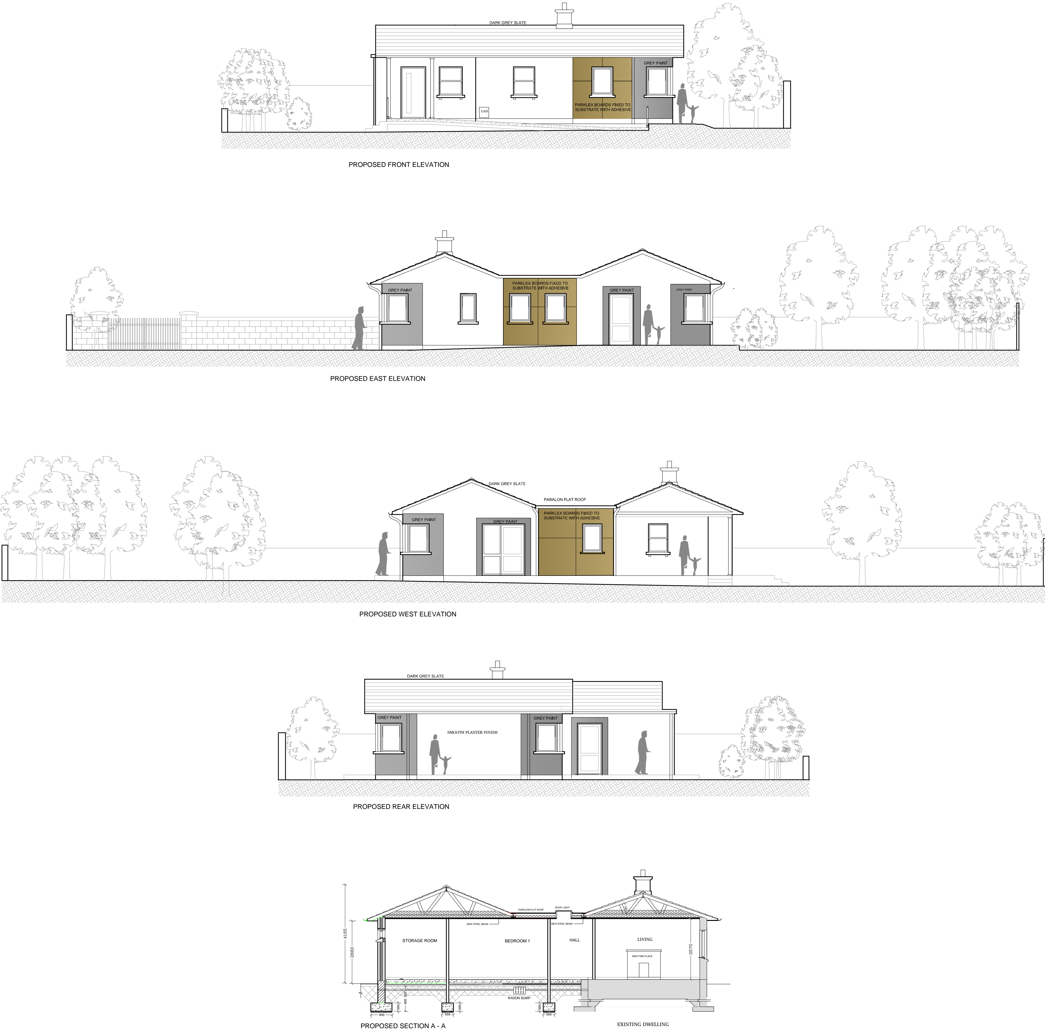
PROPOSED ELEVATIONS AND SECTION 1:100

KEY: SITE BOUNDARY HOUSING EXISTING TREES