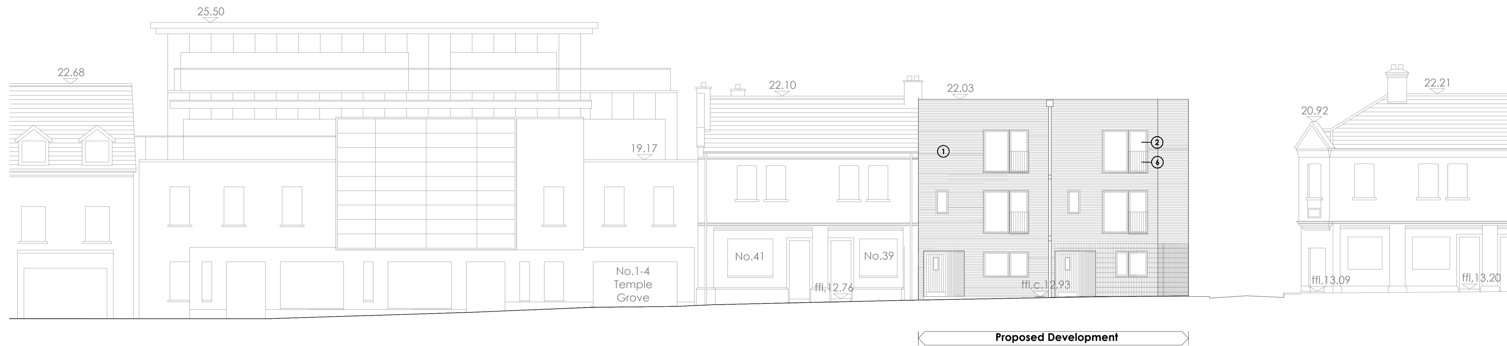
ELEVATION TO ST TEMPLE ROAD Scale 1:100