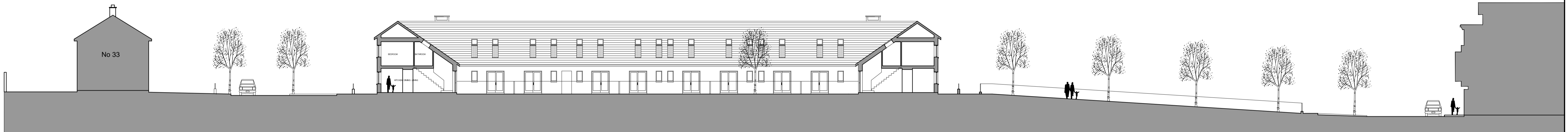
SITE SECTION C-C