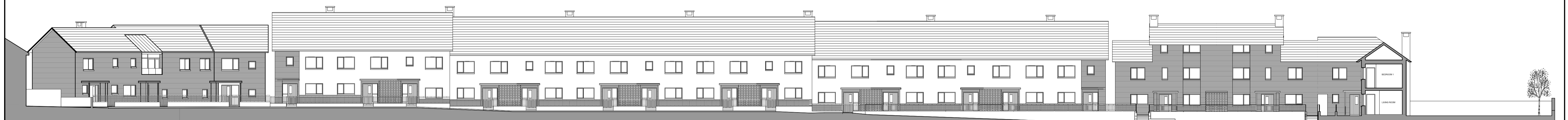
SITE SECTION B-B