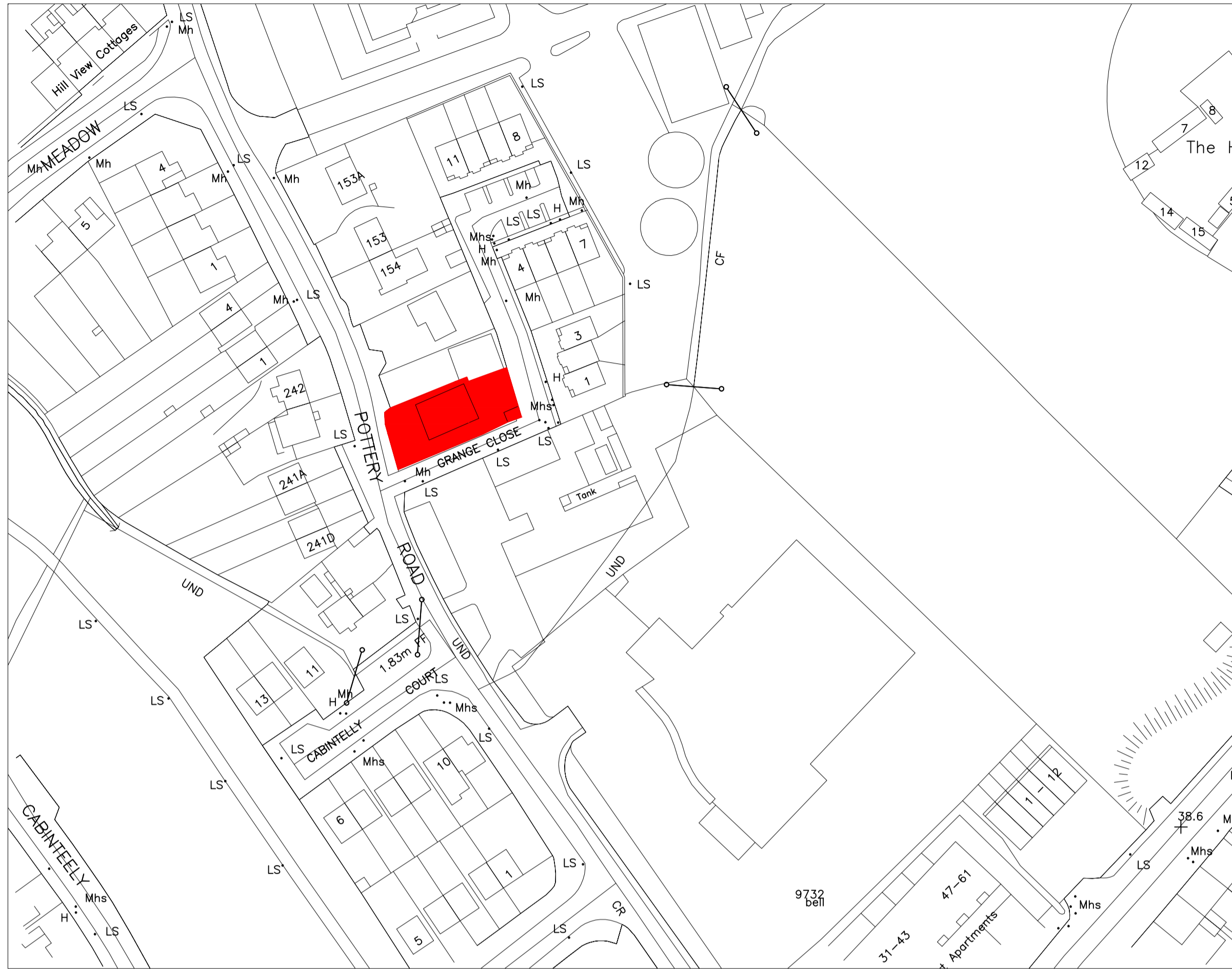
SITE LOCATION PLAN 1:1000 EXTRACT FROM O.S. MAP 3456-5