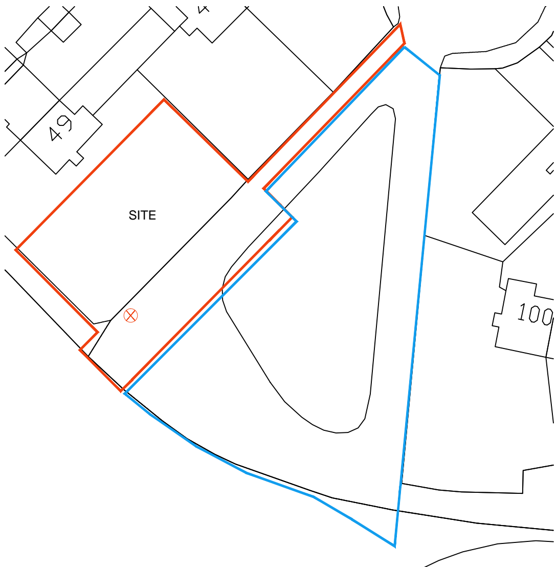
EXISTING SITE PLAN 1:500