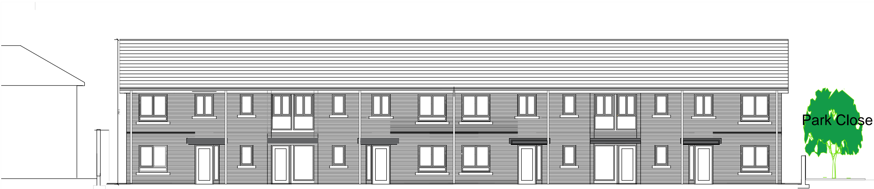
FRONT ELEVATION TWO STOREY BLOCK F-F