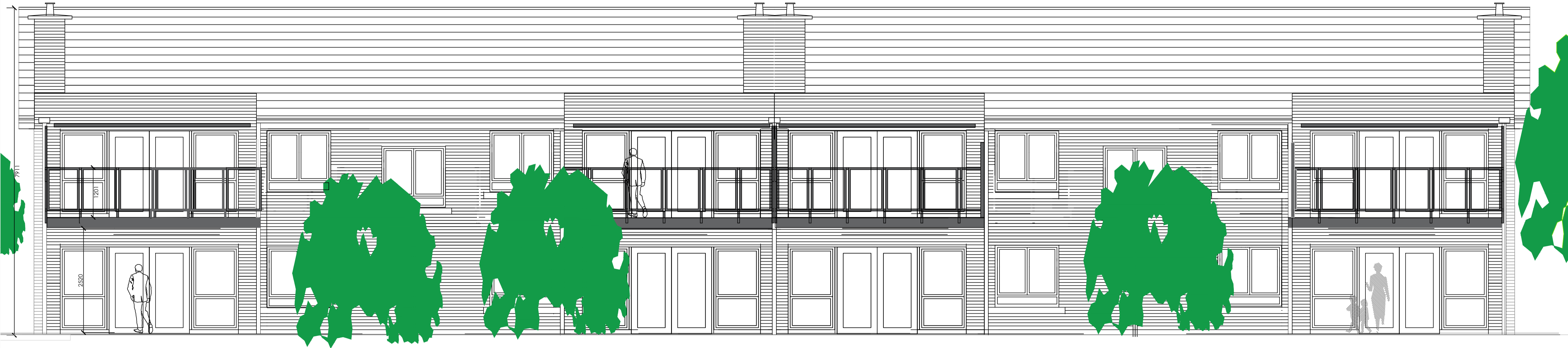
TO COMMUNITY CENTRE WEST ELEVATION TWO STOREY BLOCK G-G