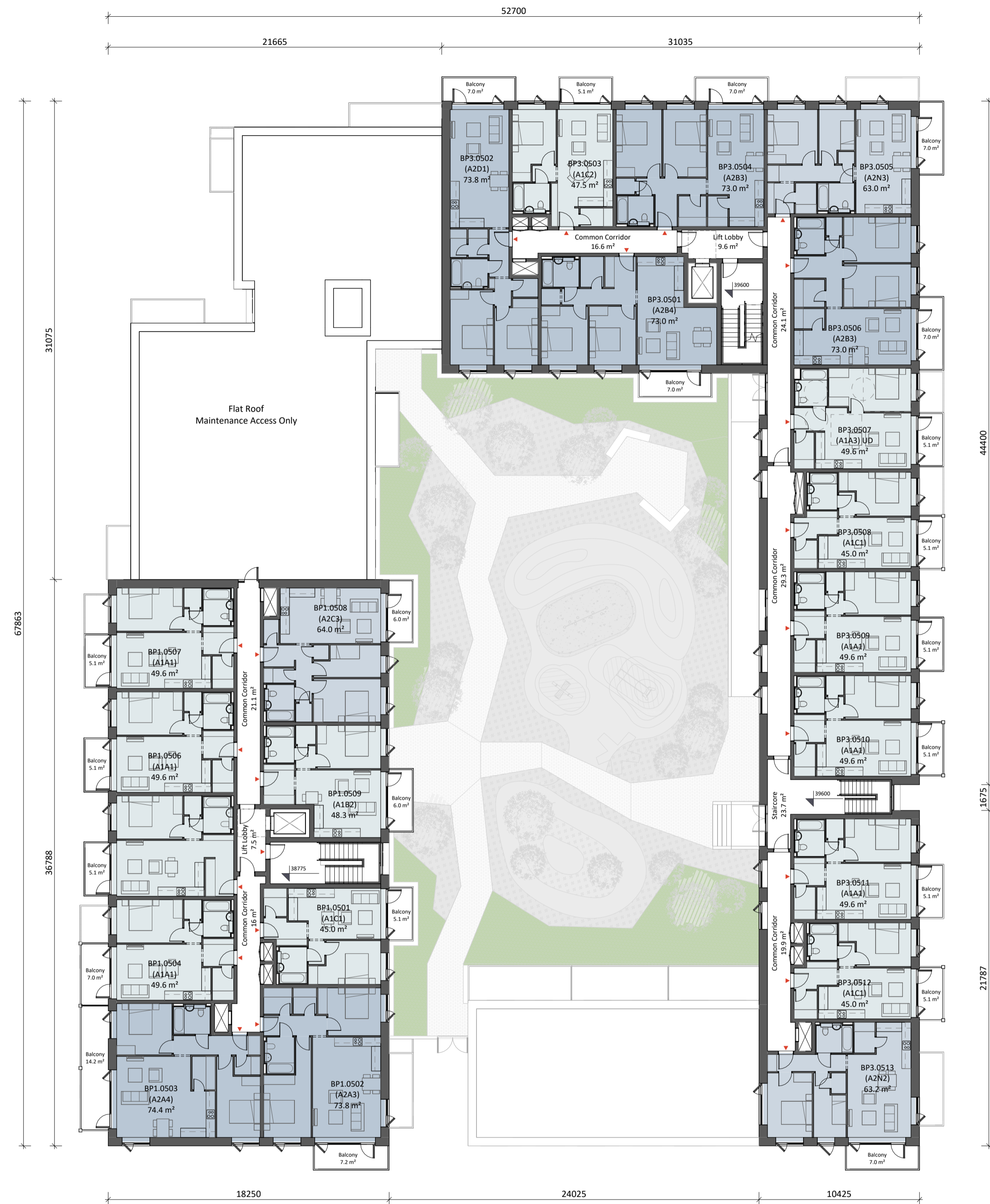
② Block P - Fifth Floor 1:200