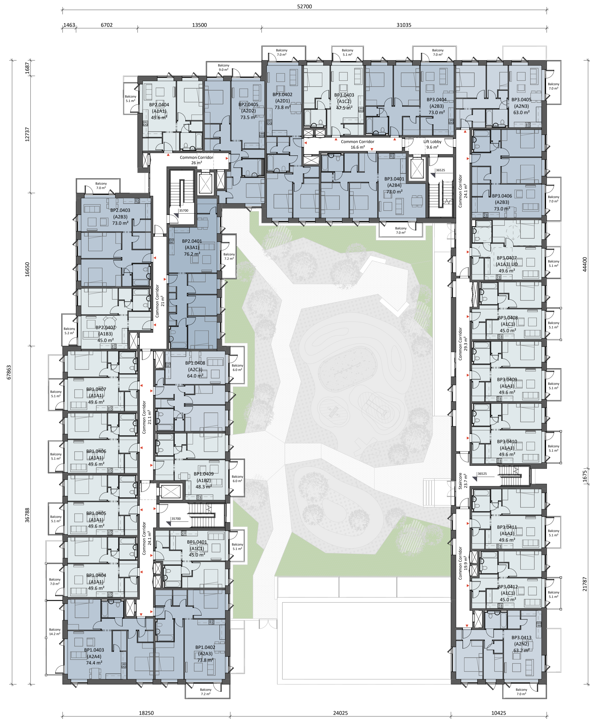
① Block P - Fourth Floor 1:200