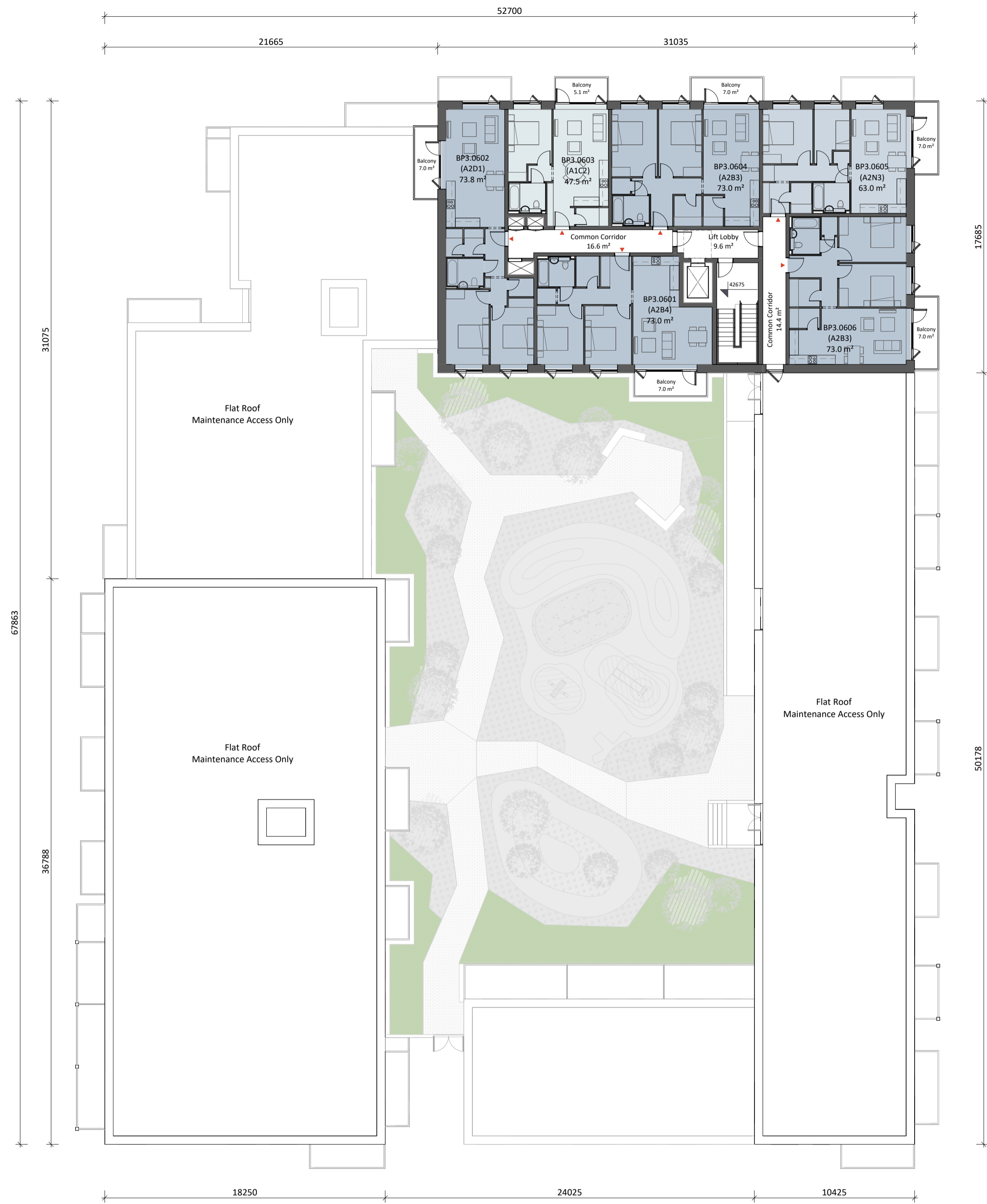
① Block P - Sixth Floor 1:200