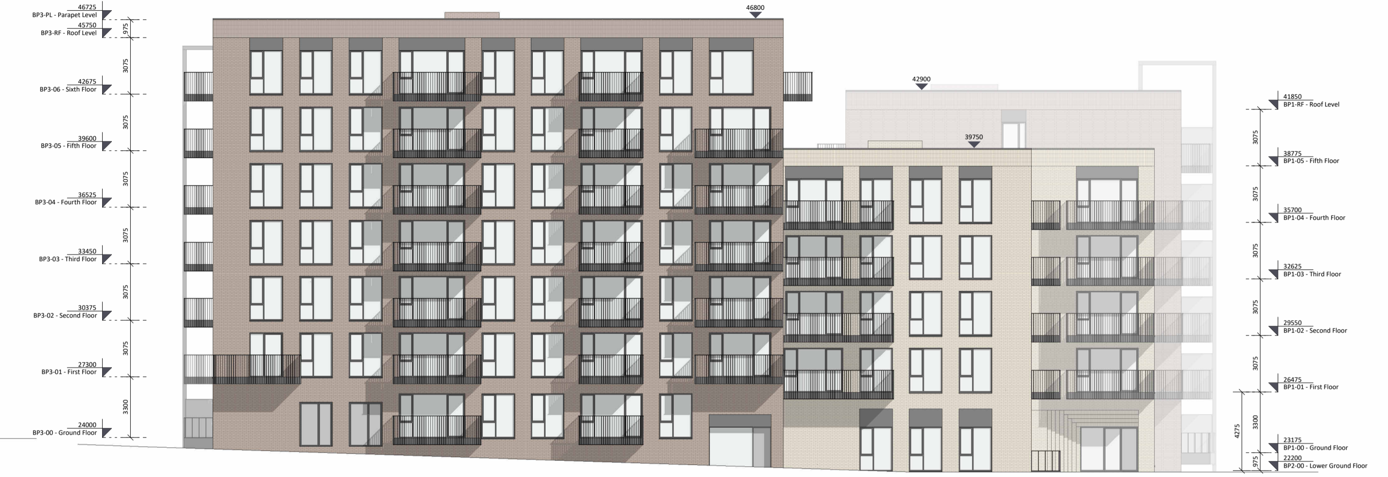
② Block P - North Elevation 1 : 200