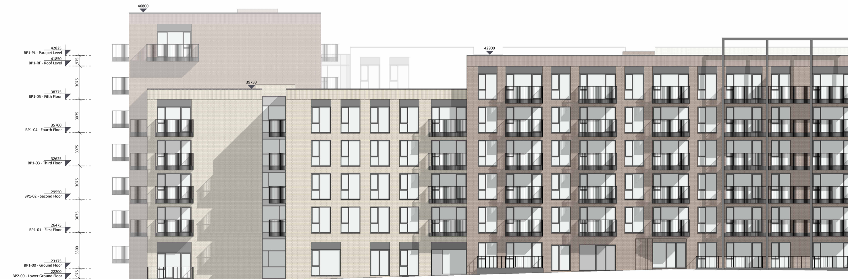
④ Block P - West Elevation 1 : 200