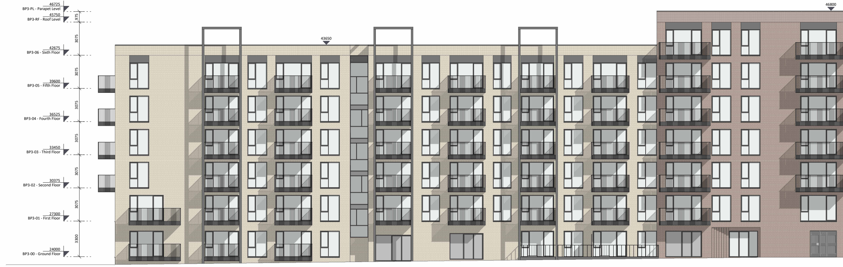
① Block P - East Elevation 1 : 200