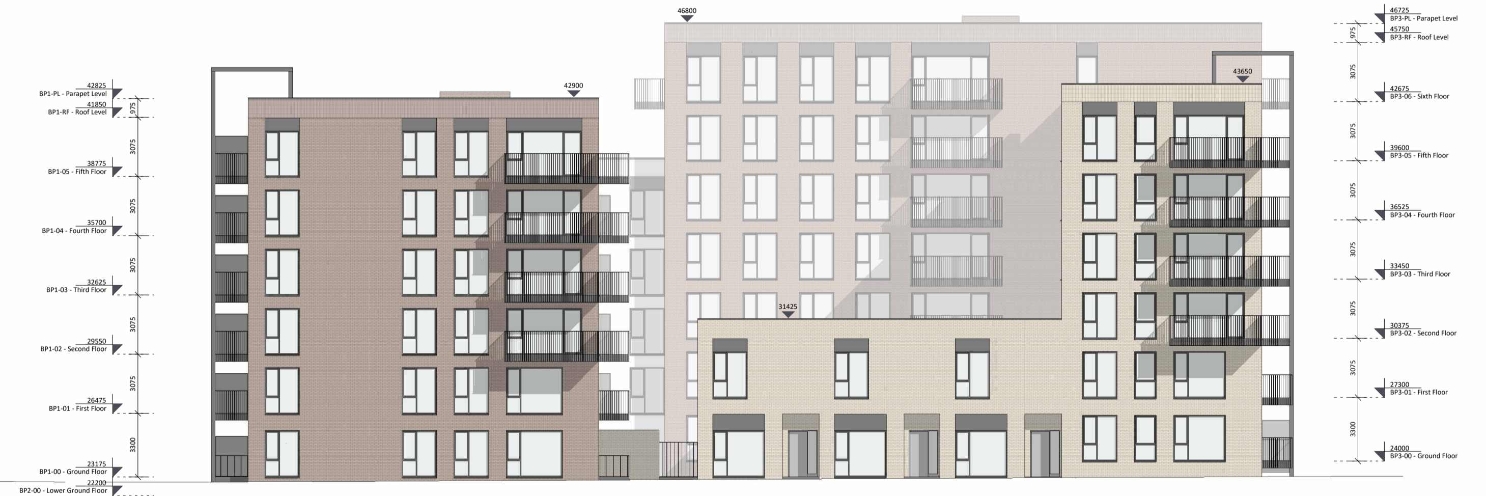
③ Block P - South Elevation 1 : 200