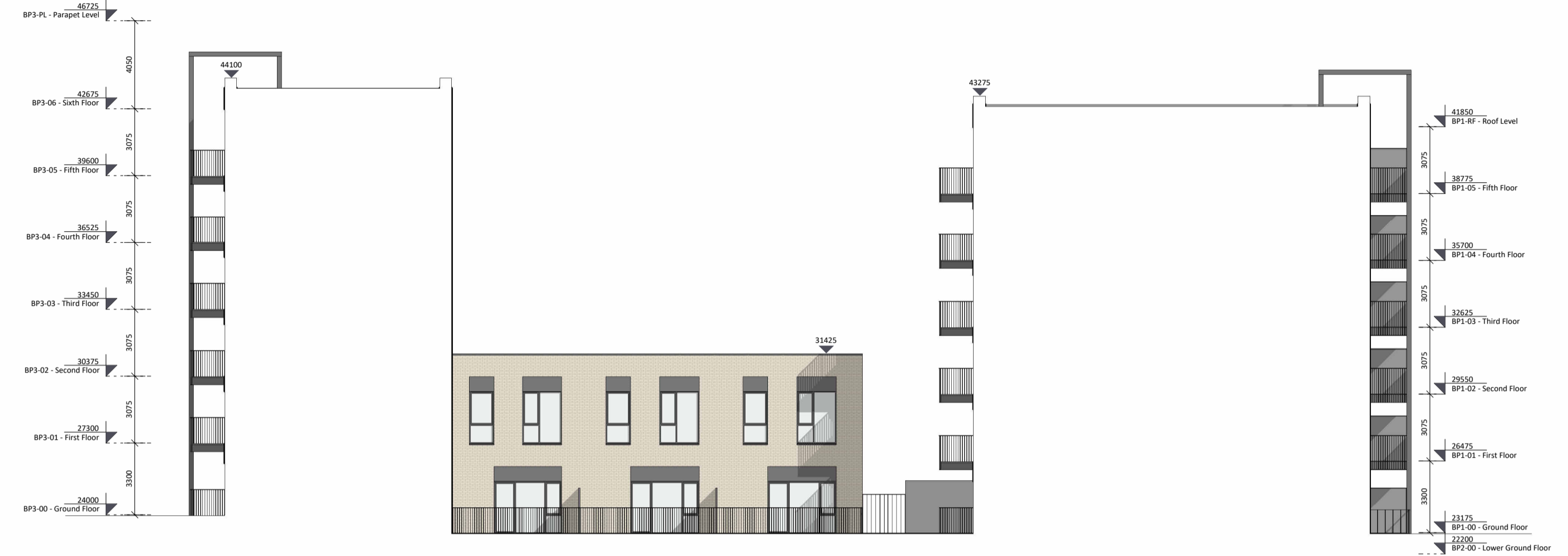
② Block P - Courtyard North Elevation 1 : 200