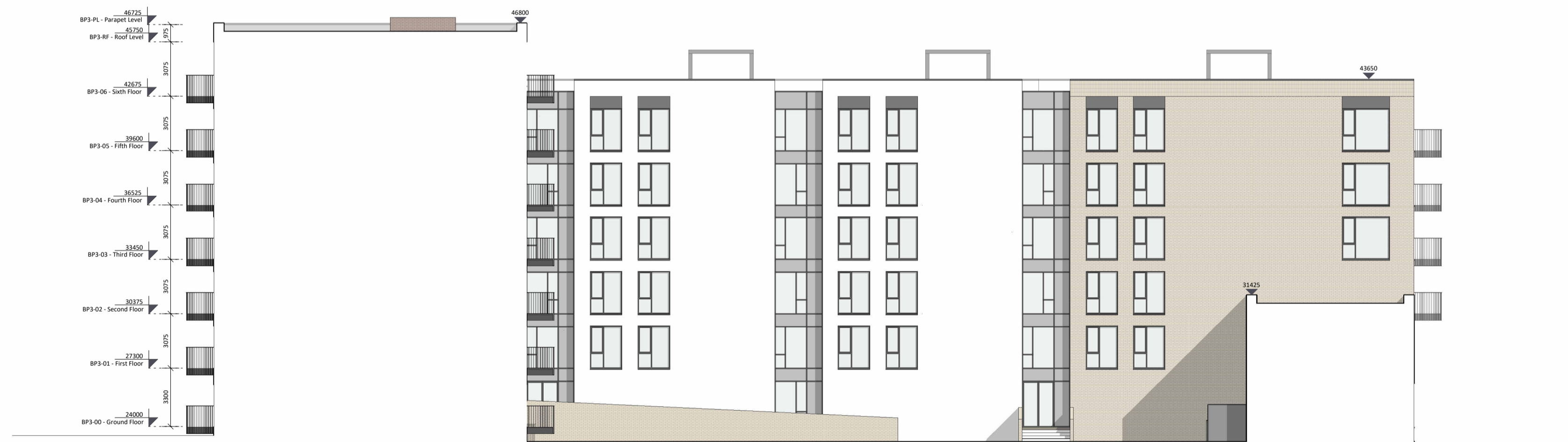
④ Block P - Courtyard West Elevation 1 : 200