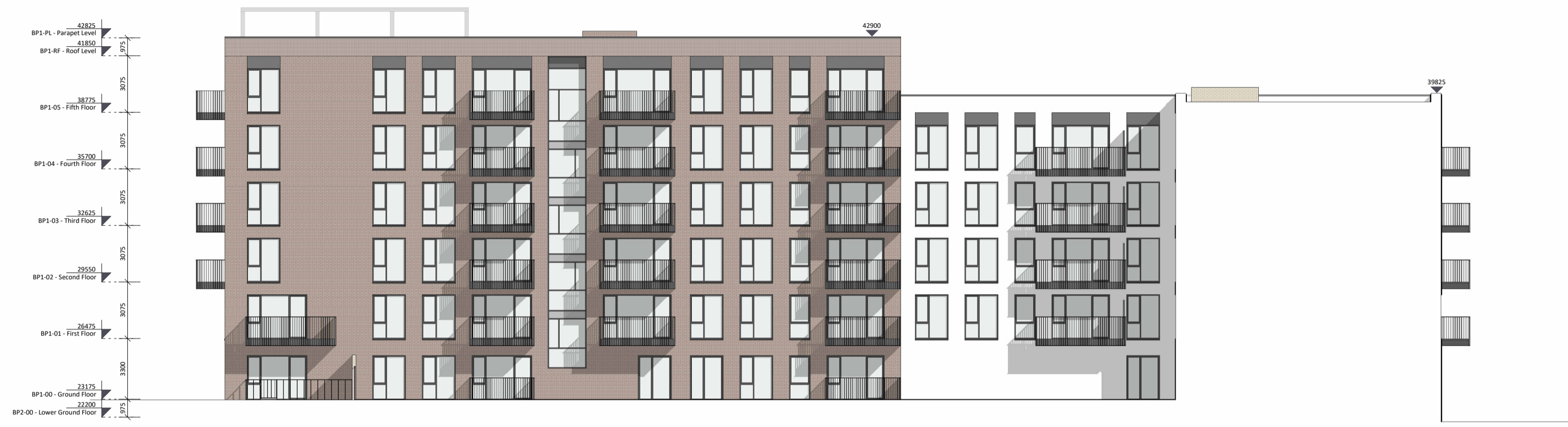
① Block P - Courtyard East Elevation 1 : 200