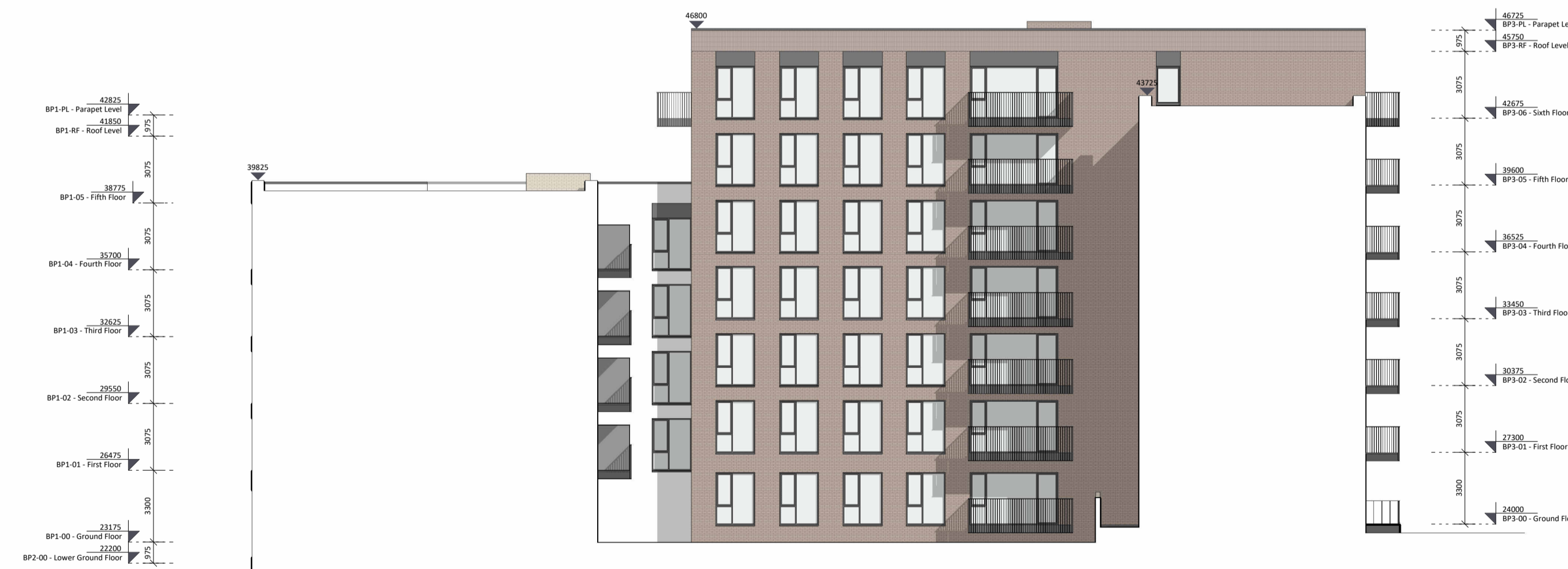
③ Block P - Courtyard South Elevation 1 : 200