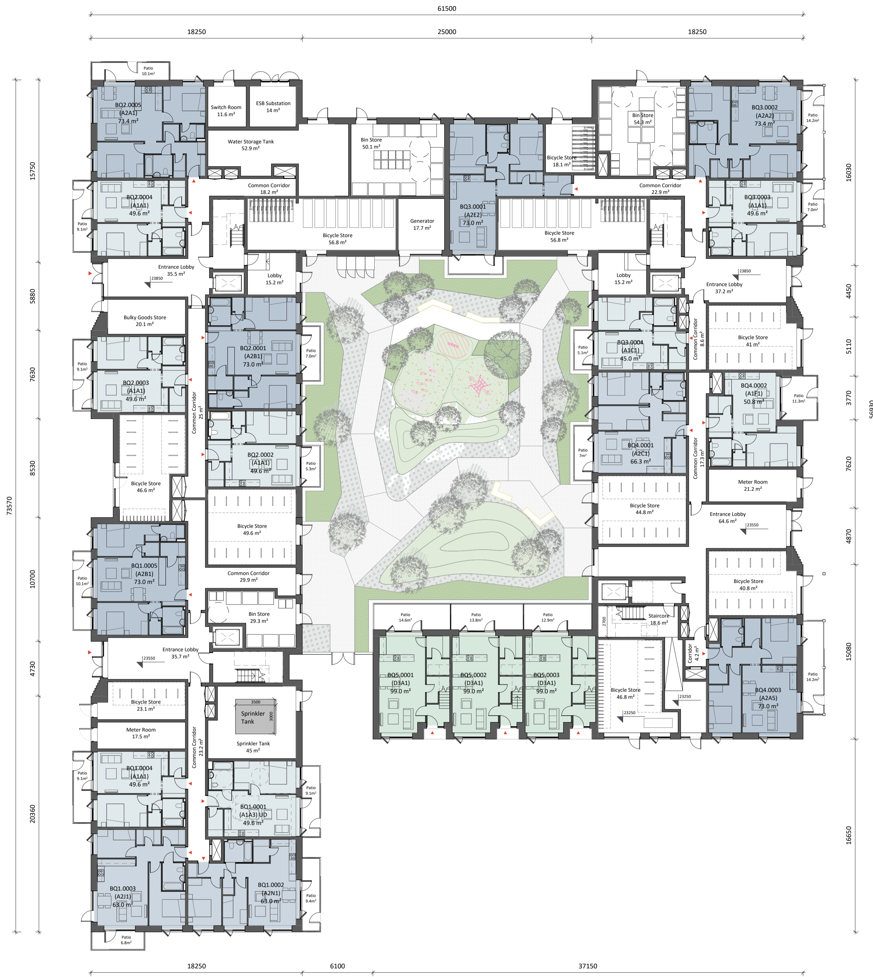
1 Block Q - Ground Floor 1:200