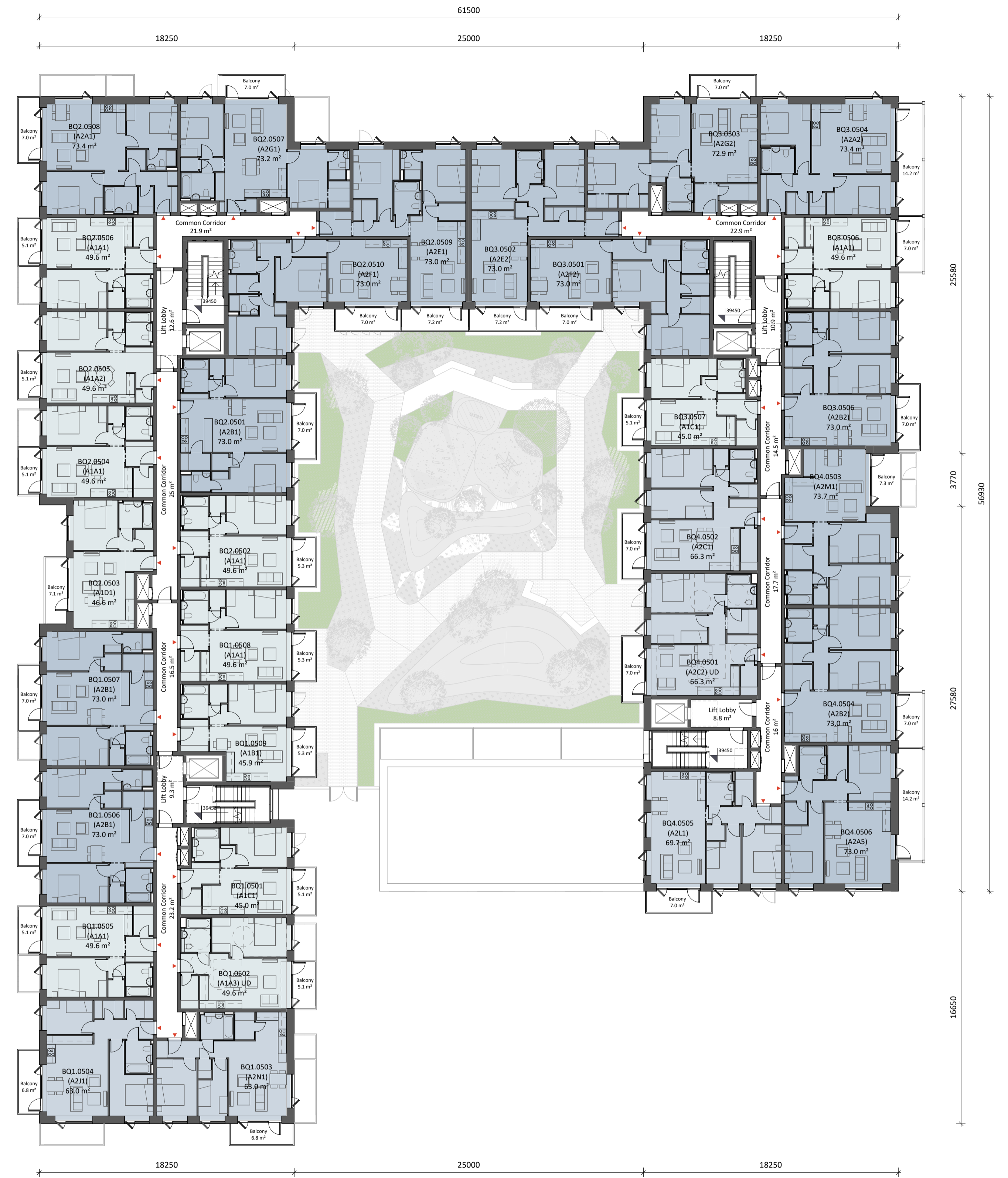
2 Block Q - Fifth Floor 1: 200